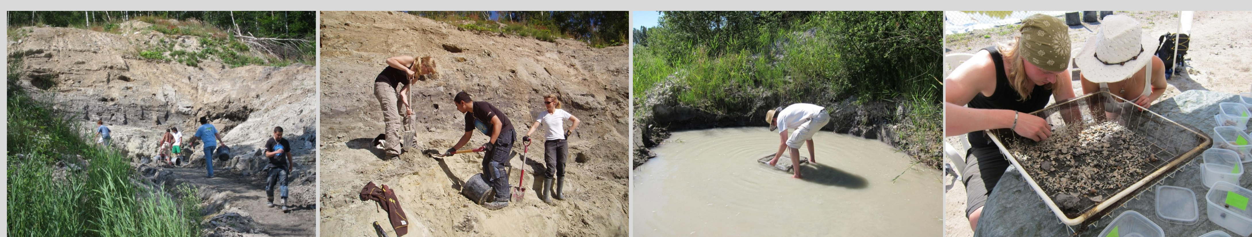
Fig. 3. Working process during the excavation at Åsen summer 2012: digging, sieving and sorting.