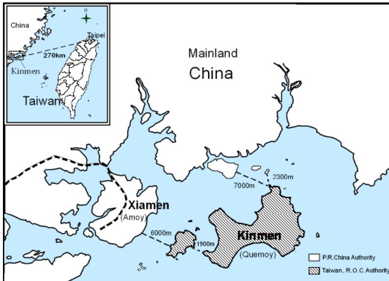
Figure 1. Map Showing Position of Kinmen Island in Relation to the Mainland and Taiwan.