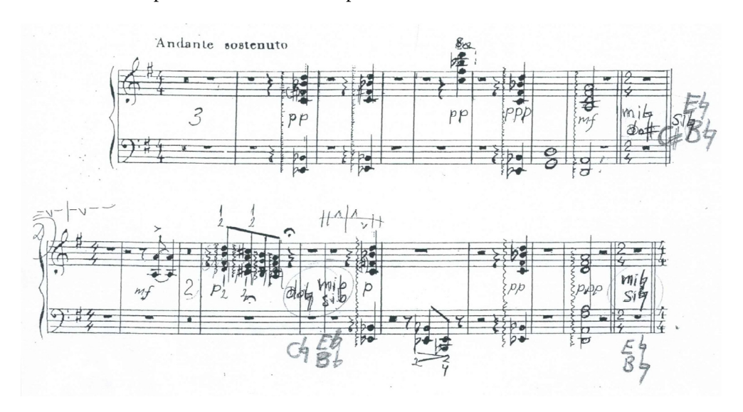
Example 2.2. Excerpt from Giacomo Puccini's Turandot showing multiple layers of markings by different harpists (excerpt from photocopied part in possession of the author).

Harpists customarily mark their parts before rehearsals with, for example, pedal markings, fingerings, and enharmonic changes (Example 2.2). It is not uncommon to change passages in parts. There are several reasons to change or rewrite harp parts. One is to be able to play a part in the preferred musical style. Another reason to change harp parts is to execute the part according to tradition. Both of these reasons to edit parts can be regarded as part of a tradition or a musical context. Another reason to change a part is to try to adapt the part to the effect the composer probably wanted, and the last reason is to make changes to make the part playable. These last two reasons can be related. It is also possible that errors in a part must be corrected (Rose, 2007).