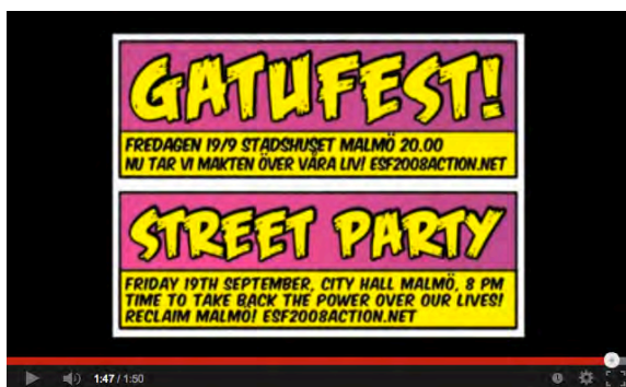
Figure 1. Pay-off in a mobilisation video for the ESF2008 (see appendix 1)

genre see appendix 1-4). Other labels used to describe this mode of video are 'protest trailers', 'demo-teasers', 'protest promos', 'call out videos', or 'riot porn'. Explicitly calling for political action, the mobilisation video urges viewers to take action by joining a protest in the streets, or to engage online by further spreading the call for action in personal networks. These are short, piecemeal, bite-sized slogans most often adapted to the time frame of a television advertisement. As a flexible genre, guiding rather than determining styles and strategies, mobilisation videos follow a set of shared dramaturgic rules. They bring together discursive resources and historical genres to stage injustice as a spectacle that requires action and set up a given space of action for the viewer. This is often done by drawing upon footage and photographs from previous demonstrations and actions that are re-appropriated and given new meaning in new calls for action. Mobilisation videos end with concrete directions for how to act upon what is witnessed on screen, usually by providing a link to a website where the viewer can get additional, more detailed information on the promoted event (see fig. 1).