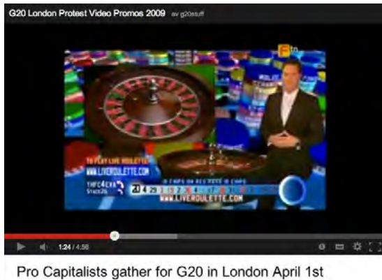
Figure 3. Framing the news anchor as croupier in the absurd theatre of casino capitalism.

Another example of the critical and playful remixing of content characteristic of the political mash-up video is seen in the Indymedia production 'Pro Capitalists gather for G20 in London April 1st'. In this video, scraps of CNN, BBC, RT and FOX news reports on the global financial crisis are 'jammed' so as to ridicule and subvert the statements of politicians, bankers and news anchors.