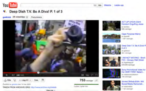
Figure 2. YouTube search result connecting struggles across time and space

T VTV, 4 Deep Dish and DIVA TV 5 documenting the ACT UP (The AIDS Coalition To Unleash Power) protests of the late 1980s are presented next to recently uploaded videos of the Occupy Wall Street demonstrations and videos discussing the role of social media in the Arab spring (See fig. 2).