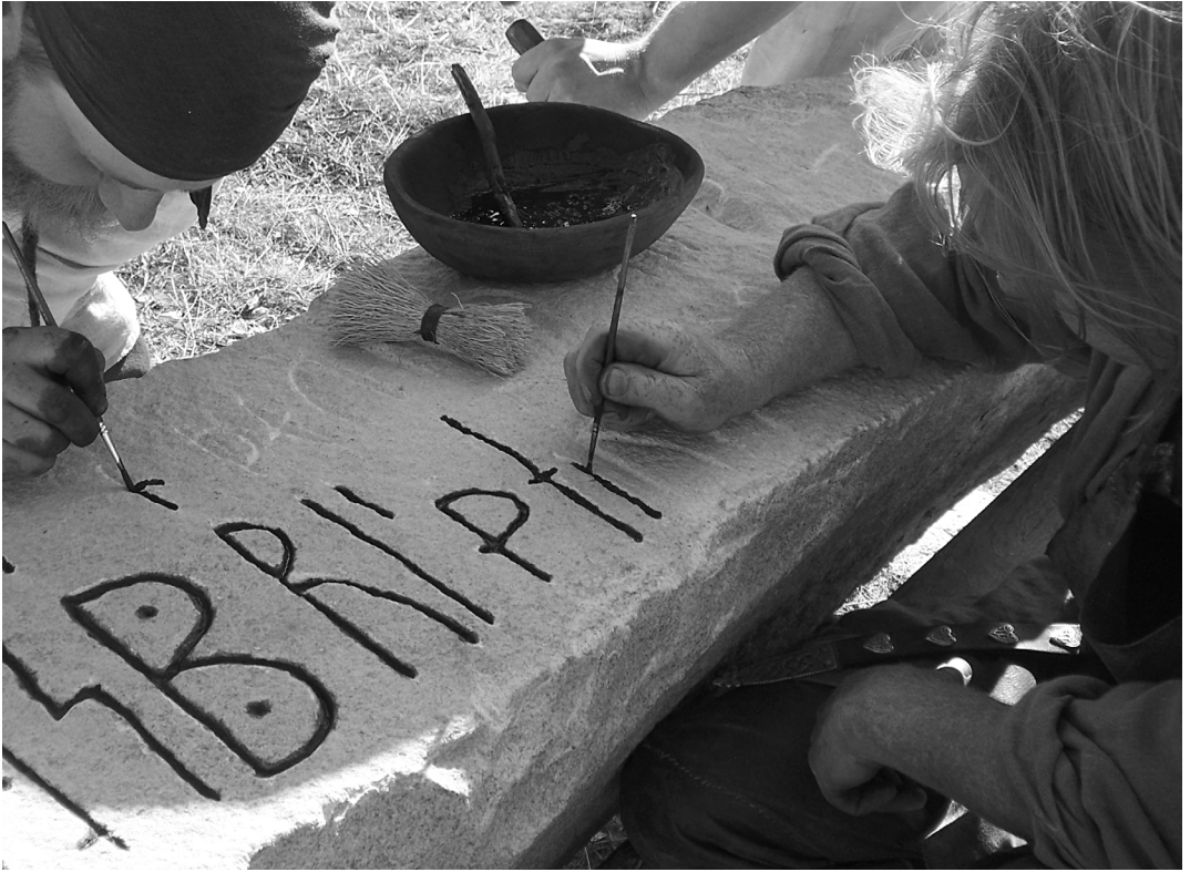
Fig. 5. Copy of the Gimsøy rune stone made by Janne Jonsson Eldskägg.

Juul's rune stones have been carved in connection with Viking markets related to Viking villages or farms such as Foteviken, Borre and Storholmen. In addition to carving rune stones, Juul also does carvings in wood (Harald Juul website) (Fig. 6).