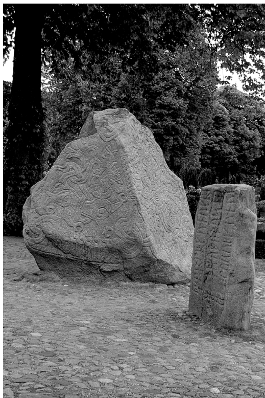
Fig. 1. The Jelling rune stones from the Viking Age.

For a long time, people have been aware that messages set in stone last, if not forever, at least for a relatively long time. Nothing in history seems to have changed these conditions. In spite of acid fallout that can make the stone weather, stone still appears to be the best choice of material for a message to reach beyond one's own time. Probably this is the charm of stone carving. Memories set in stone support immortality. Stone carving becomes a way to extend one's own and other individuals' existence in this world. The storage media of our time are not to be compared with stone. Today's documentation is in many cases demagnetized within few years and thereby becomes inaccessible for future generations unless regular updates of information and technology are made.