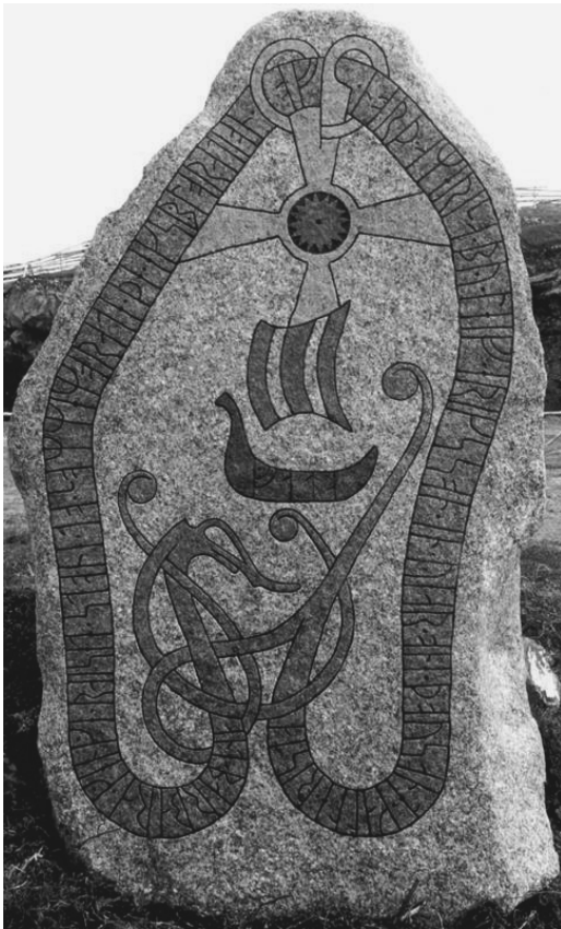
Fig. 4. Rune stone erected in northern Newfoundland in the year 2000 celebrating Leif Erikson's discovery of North America a thousand years ago.

May continued comfort prevail and peace on earth. Kalle carved."