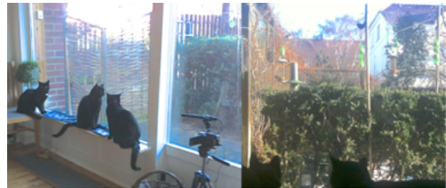
Figure 1. Recording set-up with bird food outside the window and video camera with shotgun microphone.

microphone) was positioned on a tripod next to a large window. A variety of bird food was arranged outside (apples and bird seeds on the ground, bird feeders containing peanuts and fat ball nets on strings and poles). When the cats were vocalising at birds through the window, recording could be started from an adjacent room using the remote control without disturbing the cats. Additional recordings were done with an Apple iPhone 3G. Figure 1 shows the set-up for the video camera with the shotgun microphone.