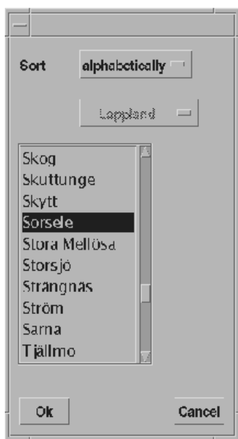
Figure 1. Example of Recording Location dialogue box.

Using the database, digitized phrases complying with any combination of these parameters can be extracted. A desired parameter combination is chosen by entering the appropriate information in a dialogue box. For example, a search may begin by identifying one of the recording locations available in the database. These locations are given either alphabetically or by province in the Recording Location dialogue box illustrated in figure 1 (in which 'Lappland' is the name of a Swedish province). For example, selecting 'Sorsole' as the interesting local dialect returns the Prosodic Parameter dialogue box shown in figure 2. From that box, selecting 'older', 'man', 'plain ( i.e. , simplex) word', '2 syllables', 'accent type 2' and 'focus' amounts to specifying the intersection between those parameters, i.e. , a phrase containing a bisyllabic accent 2 word [ti:u] 'ten' with focal accent as produced by an elderly gentleman of the Sorsole dialect.