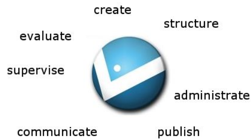
Fig.2 Luvit Education Centre at LU

To summarize our experiences we will emphasize the needs for special requirements to success with implementation and to make eLearning as an integrated part of the educational system. Main requirements are; visions, engaged management, strategies, centralisation-decentralisation, funds, structure and finally devoted staff.