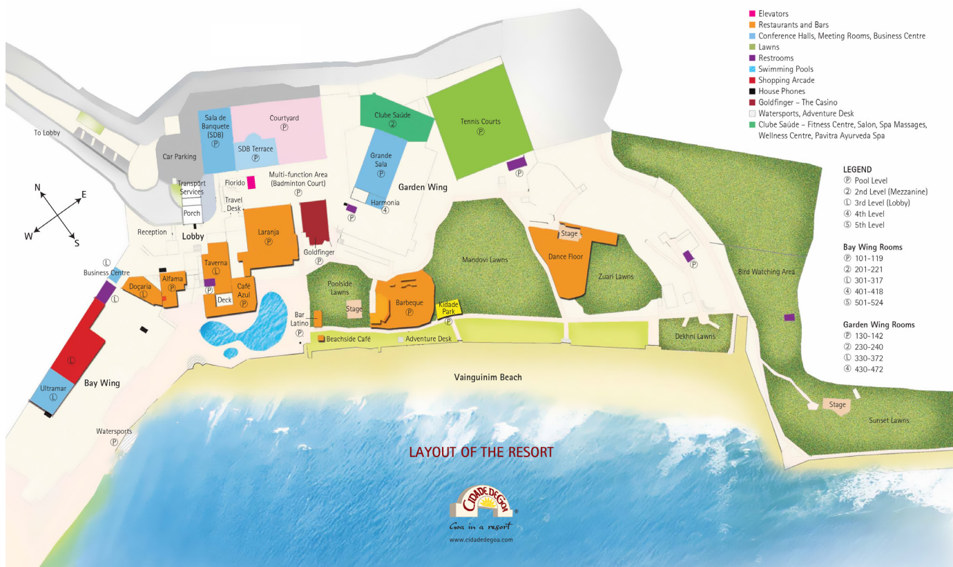
Map 1: Meeting venue - Cidade de Goa ( http://www.pages-osm.org/osm/location/venue )

PAGES 4 th OSM is held at Cidade de Goa Beach Resort, Dona Paula, Goa (see map). The inaugural session and all plenary sections is held at Grande Sala . The parallel oral sessions are at Grande Sala and Sala de Banquete . Breakout sessions and group meeting can be held at Harmonia , if booked with the conference office in advance. Poster sessions are held at Mandovi lawns and Zuari lawns .