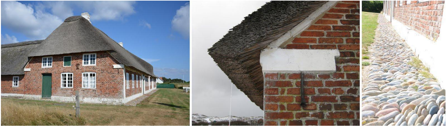
Figure 4: Climate responsive design as seen in Abeline's Farm, showing from left to right: half-hipped roofs reduce wind pressure on the gables, wide eaves protect the building from precipitation and summer sunlight, and pebbles lead precipitation away

In summer, sun light only comes into the front part of the southward rooms. Sunlight thus contributes to heating during the cold winter months, while the house is kept cool during summer.