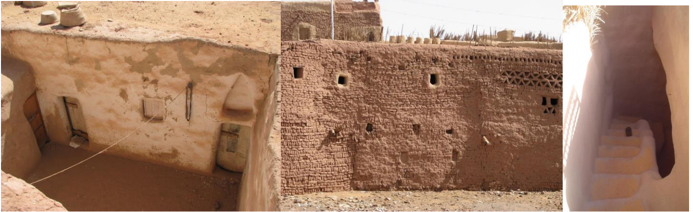
Figure 3: A collective shots for the Mayor house showing from left to right, the passive climatic responsive solutions in coping with hot climate like shaded courtyards, small windows facing prevailing favourable winds and staircase that acts as air shafts.

The average thickness of external mud brick walls ranges from 35 cm to 80 cm. Thick walls serve as heat insulators, create natural thermal regulation and provide protection against the extreme temperatures that build up between the outdoor and indoor climates. The dimensions of openings (windows) range from 35 cm × 40 cm to 40 cm × 50 cm. They are relatively small to avoid direct sunrays and reduce glare in summer. Some are placed facing north to capture pleasant winds on summer nights and the others face south for warm sun in winter. Inhabitants tend to close the windows firmly with cotton pillows whenever needed to protect them from glare, sand storms and strong winter winds. The house residents tend to open windows for cross ventilation on summer evenings to get rid of warm heat transmitted from the walls during day time. This leads them also to use ingenious systems for air traps; for example, the courtyard and the staircase shafts function as wind catchers or as wind scoops.