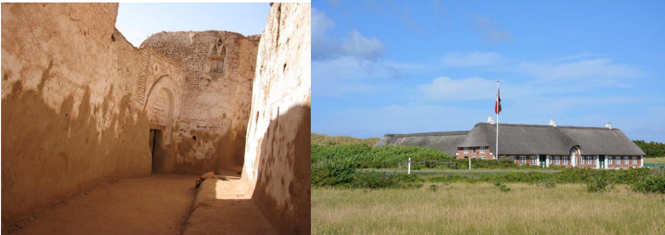
Figure 1: To the left, the Mayor house in Balat town, Egypt