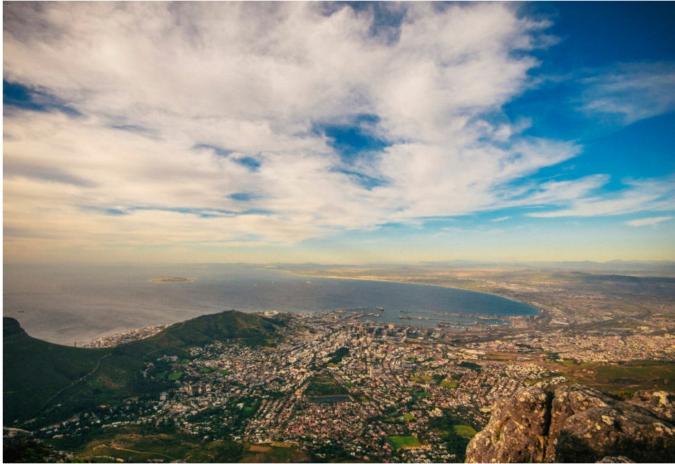
Photo of Cape Town, South Africa. View of city centre from Table Mountain National Park.

Selection based on critical cases is particularly useful in this type of exploratory qualitative research where the case represents the studied phenomenon in a way that has the potential to yield the most interesting data and the greatest impact on the development of knowledge, including theoretical understanding.