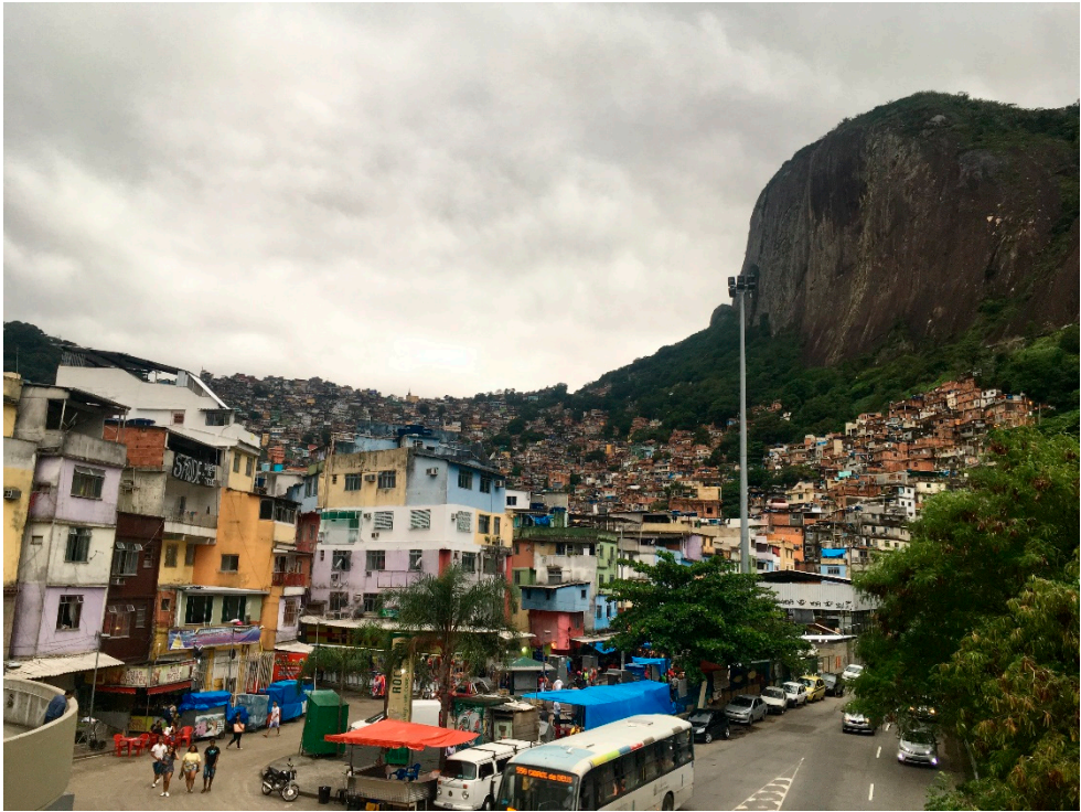
Photo of the informal settlement Rocinha, Rio de Janeiro, Brazil where we conducted focus groups with residents.