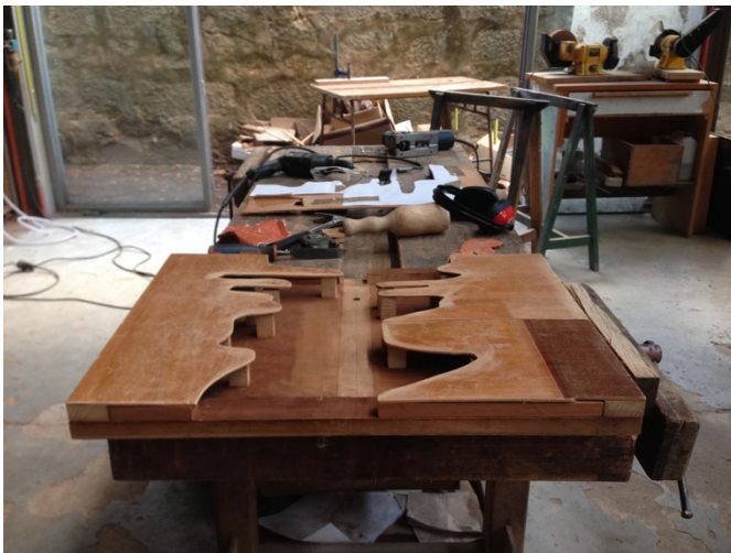
tientos topográficos :: tacto temperado by Bertrand Chavarria-Aldrete

Plastic Extension is a new form of music interpretation that goes beyond translation, synaesthesia or musical analysis. This form of creative criticism takes the instrumental interpretation of a work (the praxis) as a gleaning phase, a poietic process preceding the plasticity of an art work, an intervention in music production.