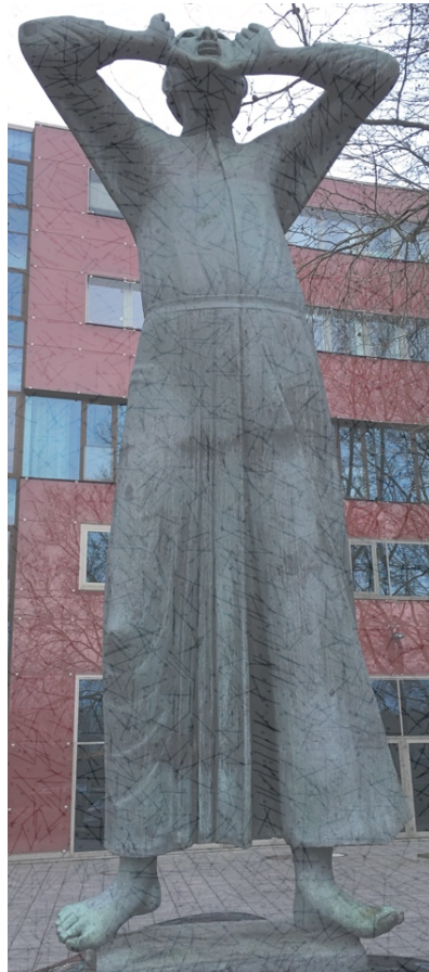
Der Rufer by Gerhard Marcks (1889 - 1981)

For some time, I have been interested in the motions of turbulence in fluids and was intrigued to enter into discussions about perhaps one of the greatest discoveries in physics in the first half of the 20th century, that of superfluidity. Superfluid helium (also known as He II) occurs when liquid helium is cooled to within 2.172 degrees of absolute zero (absolute zero is about -273° C). In this ultra-cool region, helium can flow without viscosity or friction, but seldom without turbulence. As I learned through