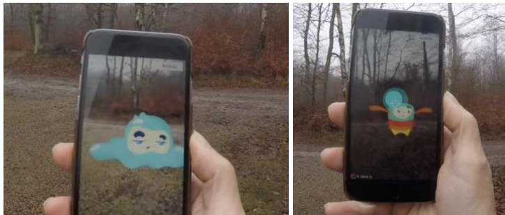
Fig. 1. Screen shots from the cloud game (left) and bug game (right).

The two games are set within an overall framework where you collect some kind of alien plants (“PlantAliens”), in the AR games you collect resources in order to nurture your plants and unlock new ones. The AR games increase in difficulty – initially targets keep still, but as you progress in the game they fade away faster (clouds) or start moving (bugs). The game area is selected every time you start the game, for the clouds you have four choices (close in front, middle in front, middle all around and far all around), while for the bugs there are two choices, in front or all around. Graphical elements that reflect different abilities, eg figures with wheels/wheelchair are included.