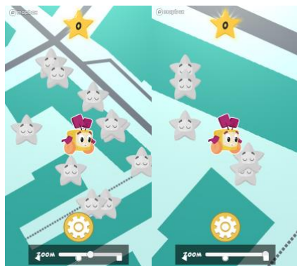
Fig. 2. Screen shots from the GPS game at two different map zoom levels. The user avatar is the yellow/red figure in the middle. When you get close to a star it wakes up, and you can catch it.

In the GPS game, the goal was to collect stars, and it allowed the user to select short, medium or long distances. The game was initially intended to be used together with the AR games to unlock game features, but due to the technical problems experienced, the GPS game was not included in the final PlantAliens app. If included, the game would have allowed users to choose freely which game to play, in order to cater to differences in abilities and preferences.