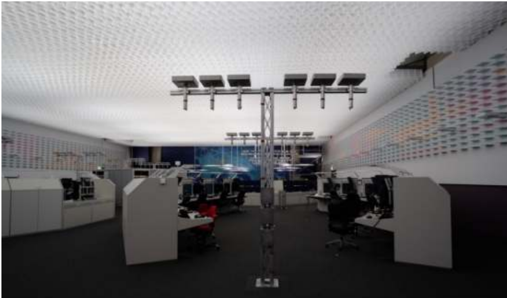
Figure 1: Light scenario during the day when workload is high

Conclusion: Integrating recommendations for healthy daytime lighting conditions with good visual conditions for computer work can be achieved by a balanced luminance distribution in the room. Besides a spectral change, the biological rhythm and psychological well-being of shift workers can be improved by additionally changing the light distribution between day and night and thus the incident light at the eye.