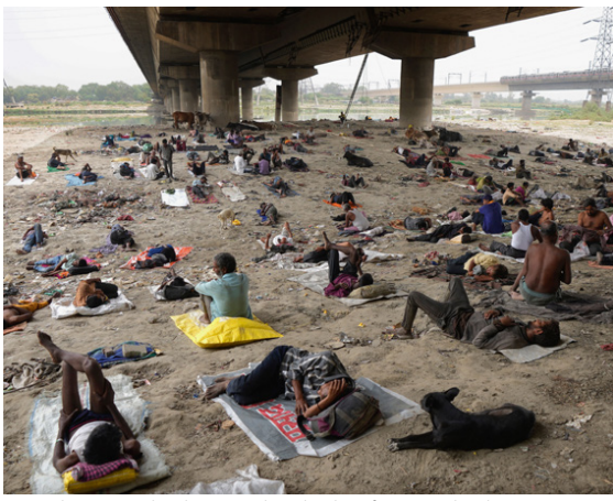
Homeless people sleep in the shade of an overbridge in in New Delhi. At least 2,000 people died in India during the heat wave in 2015, when temperatures hovered near 50 degrees C. In Pakistan in 2022, the death toll stood at 1,200, with some local estimates putting it at around 3,000.

Major flooding occurred in Germany, Belgium, the Netherlands and Luxembourg between 12-15 July 2021<sup>31</sup>. World Weather Attribution ascertains that there is high confidence that human-induced climate change increased the likelihood and intensity of this flooding<sup>32</sup>. No studies have yet calculated the full range of NELD. However, 200 people died<sup>33</sup> and a significant loss of crops and grain quality was reported<sup>34,31</sup>. Economic losses are estimated to be €3 billion<sup>31</sup>. There was widespread coverage of the emotional toll of the flooding. In particular, this related to the trauma of those who experienced the floods, those who were evacuated, those who lost loved ones, and those whose missing loved ones' bodies were never recovered<sup>35</sup>. Belgium declared a day of mourning<sup>36</sup> and one political commentator said that "the impact on the total economy stands in no comparison with the human suffering"<sup>37</sup>. All twelve residents on the ground floor of a German care home were trapped and drowned<sup>38</sup>. The health system and early warning systems did not manage to protect this group, demonstrating that different groups experience NELD in different ways based on intersectional marginalisation. In addition, many people lost their homes and all their belongings which brings a range of intangible and emotional losses<sup>37,39</sup>, as well as the loss of things with