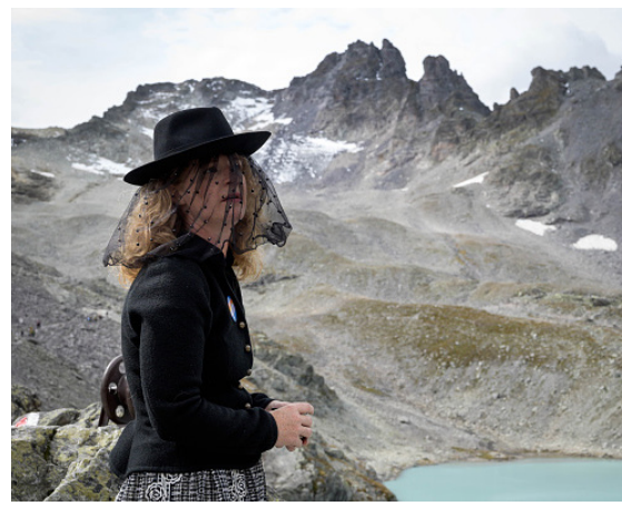
A woman takes part in a ceremony to mark the 'death' of the Pizol glacier (Pizolgletscher) on September 22, 2019 above Mels, eastern Switzerland.

As early as 1991, when the UNFCCC was being drafted, the Alliance of Small Island States (AOSIS)— a negotiating group of small island nations facing the worst climate change risks— highlighted the need to address L&D for vulnerable countries. At the time, the group proposed establishing an international insurance pool that could, for example, compensate victims of projected sea level rise, But the idea was rejected. It took another 16 years for L&D to be included in a formally negotiated UN text (the 2007 Bali Action Plan).