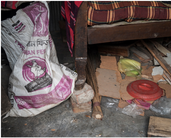
Bricks placed under a bed frame by a family living in Kallyanpur Basti, in Dhaka Bangladesh, to avoid getting wet at night when flooding occurs. Being continuously immersed in dirty water can lead to the development of skin conditions which can lead to infection

Indigenous people are more exposed to NELD due to marginalisation and exclusion. 39