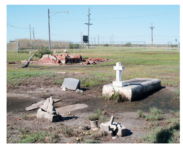
Sea level rise, saltwater intrusion and subsidence is causing the Cheniere Caminada Cemetery on Grand Isle in Lousianna, USA, to sink leading graves to list, collapse and sink into the ground.

The value of NELD is highly subjective and incommensurable. Items or feelings can hold different values among cultures or even individuals.