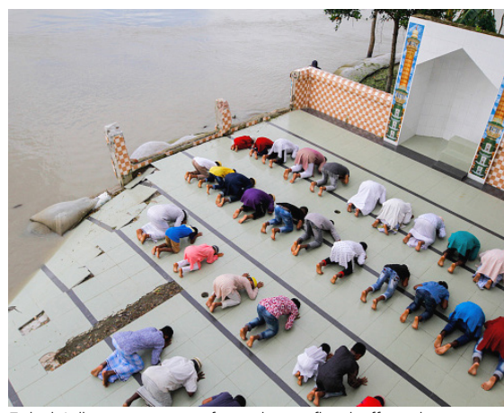
Eid al-Adha prayer is performed in a flood affected area near Dhaka, Bangladesh, during monsoon floods that displaced upto 1.1 million people in 2020.

McNamara et al.<sup>9</sup> explored approaches that can be used to address NELD in the Pacific Islands. Preferred approaches included education and training to create awareness and understanding, documenting Indigenous and local knowledge, and engaging with the natural environment. Communities that are already experiencing climate-related hazards have also created practices for addressing NELD. Van Schie et al.<sup>53</sup> explored how communities in Southwest Bangladesh are currently addressing NELD with observed