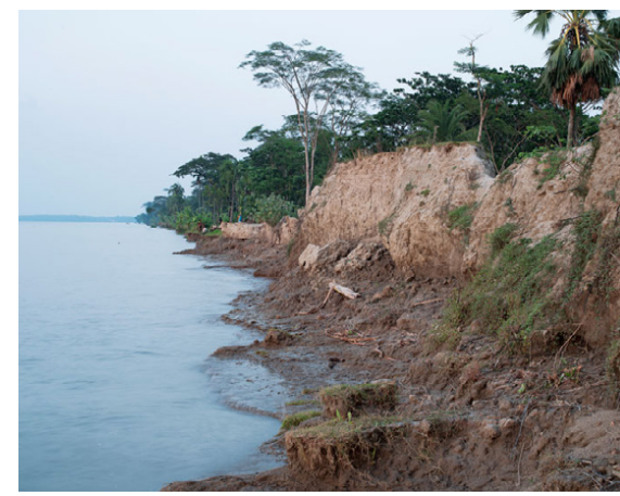
In the village of Dalbanga South in Bangladesh, cyclones have caused fatalities, whilst riverbank erosion has destoyed heritage sites and saltwater intrusion has impacted livelihoods afected the health of the comunity.

NELD are occurring all over the world (Figure 2). Yet, NELD are being disproportionately experienced by those in the Global South due to a range of historical, geographic, structural, and socio-political factors. Moreover, the NELD experienced by different people in different places is highly context-specific and influenced by intersectional identities, values, and lived experiences. We start with one example from the Global South and North to illuminate the context-specific nature of NELD.