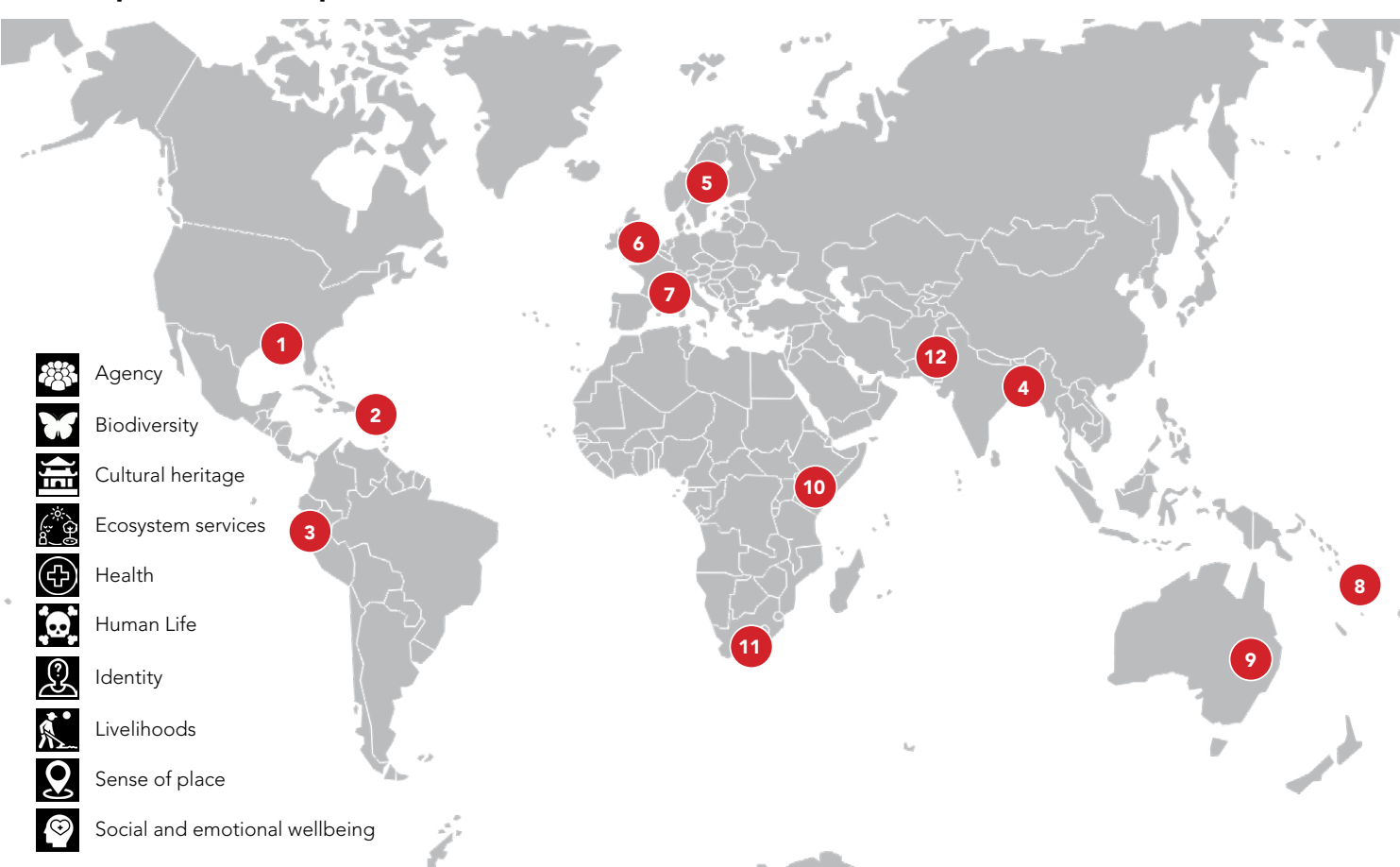
Figure 2: Examples of climate change-driven NELD around the world (adapted from Boyd et al., 2021 and reproduced with permission). ^{\rm 3}