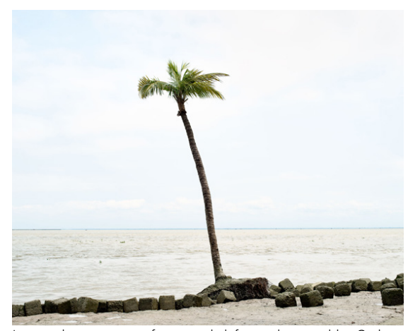
Lone palm tree atop of a coastal defence destroyed by Cyclone Aila on the bank of the Meghna river on Bhola Island in Bangladesh.

Non-economic loss and damage refers to the things of value—intangible or tangible—that are not commonly traded in markets.