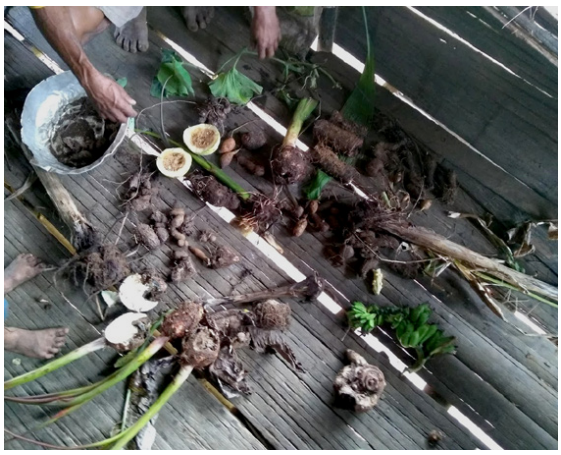
While a variety of factors wreak havoc on subsistent food systems in the Bedamuni tribe of Western Province, Papua New Guinea causing loss and damage to critical food crops, changing local climatic conditions such as precipitation regimes have increasingly had the most impact.

Entire ways of life collapse when the material manifestations of deeply grounded Indigenous knowledge, science, and philosophy are deleted by the effects of climate change.