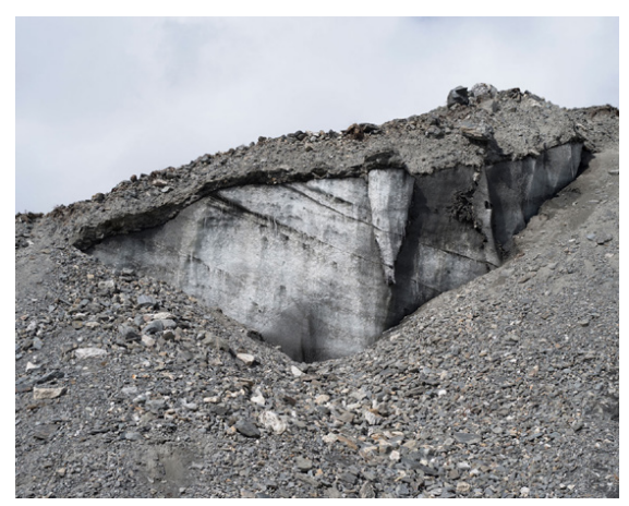
The Imja-Lhotse Shar Glacier in Soulkhumbu, Nepal, is one of the glaciers experiencing the highest rate of loss in the Mount Everest region.

The earth has entered a dangerous new era of climate impacts now that global warming is reaching 1.1°C above pre-industrial levels. <sup>27</sup>