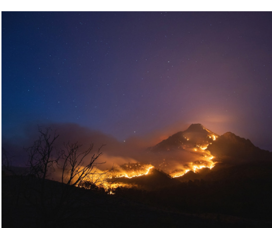
Mt Barney burning at the beginning of the 'Black Summer' bushfires in Australia, in 2019.