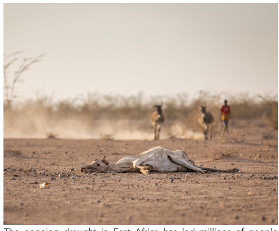
The ongoing drought in East Africa has led millions of people to face extreme hunger and left many on the brink of famine as livestock have died and crops have failed.

NELD may be directly linked to an adverse climate impact, for example, when a cultural site is lost to wildfire. They can also occur indirectly, for example, when malnutrition is experienced as a consequence of the loss of crops due to drought.