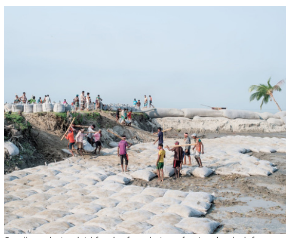
Sandbags being laid for the foundation of a river bank defence, at Elisha Ferry Ghat, on the bank of the Meghna river on Bhola Island, Bangladesh where as much as 18% of the countries land mass could be inundated be sea level rise.

Additionally, while adaptation can reduce the burden of climate impacts on societies, vulnerable nations are increasingly reaching adaptation limits. This means that they are in no position to prepare for foreseeable, and even less for unforeseeable, climate impacts. Poverty, debt, overburdened bureaucracies, lack of technical skills are all examples of factors that make effective and sustainable adaptation impossible. Where mitigation and adaptation fail, L&D is inevitable. Warner and van der Geest<sup>20</sup> suggest that L&D, including NELD, occurs when: 1) existing coping and adaptation measures are not enough; 2) measures have costs (including non-economic) that cannot be regained; 3) measures have negative effects in the longer term, despite short-term merits; or 4) no measures are adopted—or possible—at all.