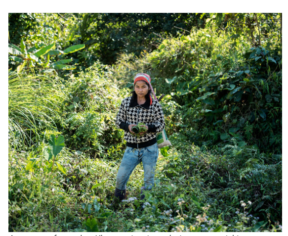
A woman from the Khmu minority ethnic group picking greens in community forest at Ban Tha Se, Luang Natha Province, Lao People's Democratic Republic. Longer dry seasons and dorught are leading to food insecurity.

Biodiversity is declining due to a reduction in water sources in Chitrakoot, India<sup>48</sup>. The Indigenous Kol community use their traditional knowledge of medicinal plants to treat humans and livestock, however, many of these plants are now disappearing. This represents not only the functional loss of medical treatment now and in the future but also the more fundamental loss of Indigenous knowledge and cultural practices<sup>48</sup>. In addition, Indigenous people are more exposed to NELD due to marginalisation and exclusion<sup>46</sup>.