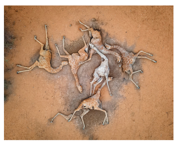
The bodies of six giraffes lie on the outskirts of Eyrib village in Sabuli Wildlife Conservancy in Wajir County, Kenya in December, 2021. A prolonged drought has created food and water shortages for the regions wild life, pastoralist communities and livestock.