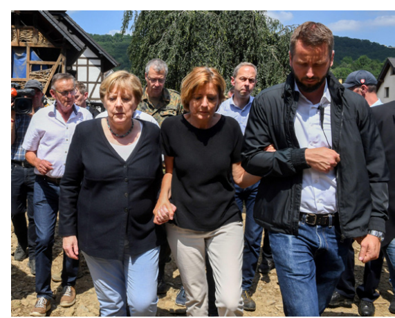
German Chancellor Angela Merkel and Rhineland-Palatinate State Premier Malu Dreyer (C) talk as they visit the flood-ravaged village of Schuld near Bad Neuenahr-Ahrweiler, Rhineland-Palatinate state, Germany July 18, 2021.

Extreme heat and elevated night time temperatures cause significant physical and mental health impacts. 29