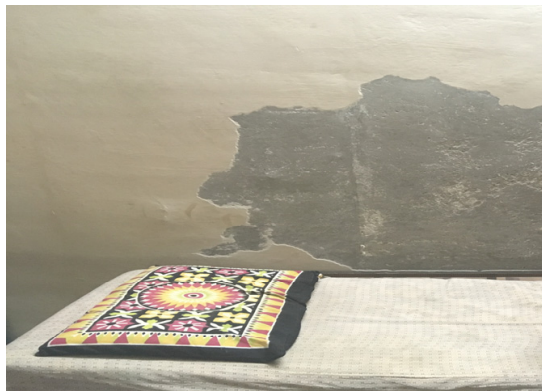
Figure 4: Weight of resettlement

The resettled families either faced violent bulldozing before almost unconditional resettlement, or moved here voluntarily with little information about the surrounding areas and their pollution and toxicity. They dubbed the resettlement area varanvashan , or life-threatening. Many complained about the township's compromising form, its claustrophobic tenements, and dysfunctional infrastructure. The punarvash (resettlement) became a nightmare for many. At a cursory glance, Figure 4 shows a wall with paint chipped off, perhaps from poor construction or maintenance. This is a convincing explanation, but the embedded narrative tells a different story.