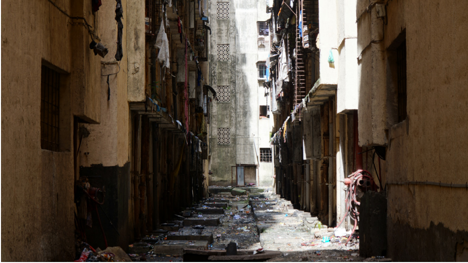
Figure 5: Dense architecture: Maximum building, minimal living

The aggregation of tenements and buildings aim to maximize occupancy. This obstructs air-flow, ventilation, and sunlight. The narrow inter-building space accumulates garbage and effluents, and becomes pathogenic.