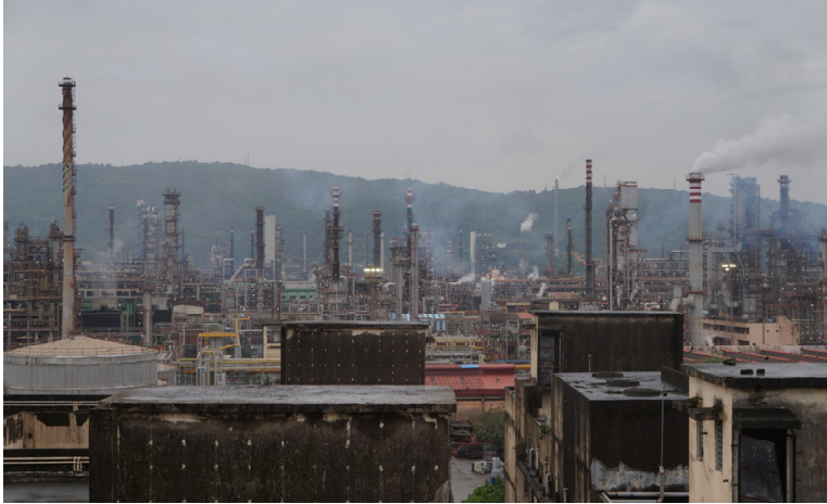
Figure 3: Un/inhabitable housing and living

Mahul and its surroundings, seen from one of the buildings in the township in 2022.