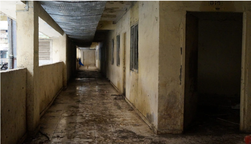
Figure 7: Extraction from formal housing

Resettlement housing presently has at least two dispossessive lives: first corresponding to extractive material life, and second to enabling or disabling forms of sociopolitical lives within these settlements. For example, one might ask the political-economic and sociopolitical meaning of the resettlement building in Figure 7 below. It is an ex-situ resettlement building which is as yet unoccupied. It was constructed during the 2000s and has since been in a state of dilapidation. Based in the theoretical discussion of the political economy, we might argue that, despite its disuse and even devaluation, the construction has led to floor-surface extraction which has already been absorbed into the city’s built environment elsewhere.