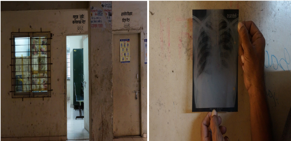
Figure 6: Tuberculosis from housing

The aggregation of tenements and buildings aim to maximize occupancy. This obstructs air-flow, ventilation, and sunlight. The narrow inter-building space accumulates garbage and effluents, and becomes pathogenic.