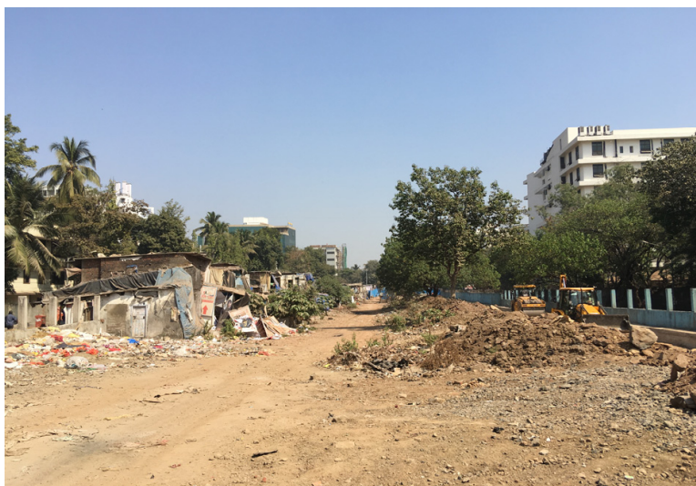
Figure 2: A pipeline project site in Mumbai. An inner-city site with ongoing work in 2021.

Weeks later, an NGO committed to urban governance, Jan Hit Manch, raised grievous concern for Mumbai’s water-supply infrastructure, its pipeline. The NGO filed a PIL in Mumbai’s High Court, arguing that slum encroachments around the pipeline were potential threats to water purity, safety, and security (see Figure 1 for site and details of concerned places). The British-era pipeline brings about 4,000 megalitres of water daily into the city. The Court acknowledged the concerns and perceived threats. This new conflict for hydrological infrastructure situated jhoppadpattis as the other of the securitized national urban. In 2009, the Court ruled the city’s civic body, the Municipal Corporation of Greater Mumbai (MCGM), should undertake clearance of over 19,000 encroaching settlements across a 10-metre stretch of the city 100-plus kilometre pipeline, undertake necessary securitization measures, and resettle the eligible poor under the SRS.