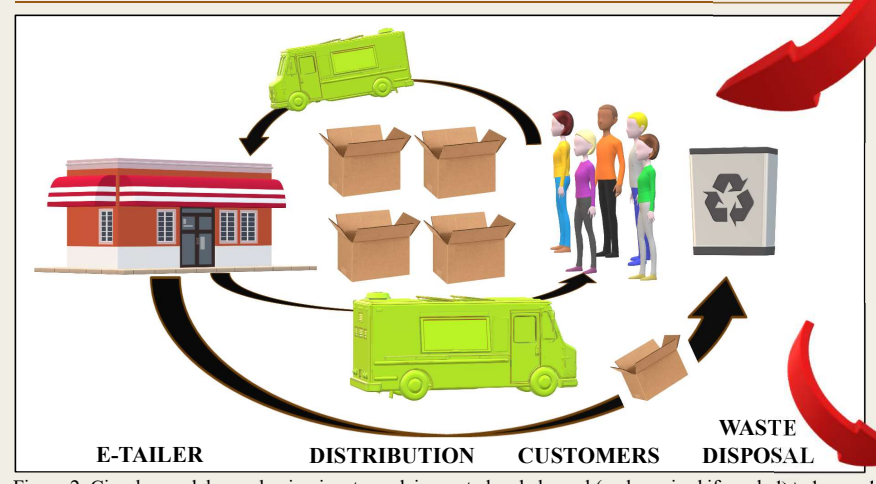
Figure 2. Circular model – packaging is returned, inspected and cleaned (and repaired if needed) to be used multiple times. After worn out, the boxes are sent to the recycling facilities.

Reusable and biodegradable box with insulation properties.