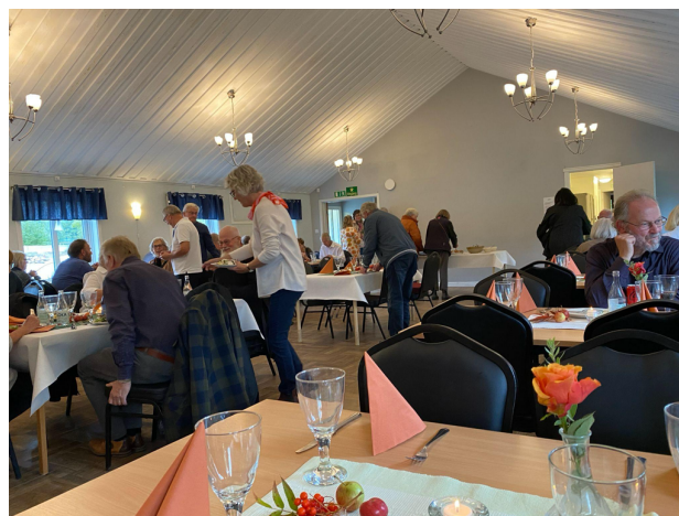
Dinner served before the Kyrko Rock concert in the Medborgarhuset 2022.

With guides in place for certain hours of the week, it would be possible to unlock the church for those hours making it more accessible, and an integrated part of the overall Ignaberga experience. In conjunction to this it might be possible to follow a strategy used by some museums and train a few young people to work as guides on a part time basis during the summer season and on weekends. The pandemic seemed to instigate people to discover their own local home district, and the use of guides coupled with the opening of the church could be used to ride on the coattails of this trend and to strengthen it.