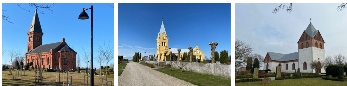
Ignaberga nya kyrka, Östra Nöbbelövs kyrka, and Odarslövs kyrka.

The objective of this project was to study how three congregations/parishes in three church environments – Odarslövs kyrka (Torn's parish), Ignaberga nya kyrka (Hässleholm's parish), and Östra Nöbbelövs kyrka (Simrishamn's parish) in the Diocese of Lund – could develop the church environments under their auspices in order to increase their accessibility and forms of meaningful use for members of their communities. It did this by working with ethnographic modes of collaborative ethnology and architectural design engagement in which the research team conducted fieldwork (involving participant observations and interviews with members of the churches and their local communities) in each of the three congregations. As part of this collaborative work the project's findings have been shared in the fall of 2023 with members of Lund's diocese as well as members of Torn's and Hassleholm's parishes (The research team reached out to members of Simrishamn's parish with a request to come, present, and discuss the project's findings, but there was no response to this request). Feedback, responses, and suggestions we have received from these collaborative meetings have been incorporated into this final report.