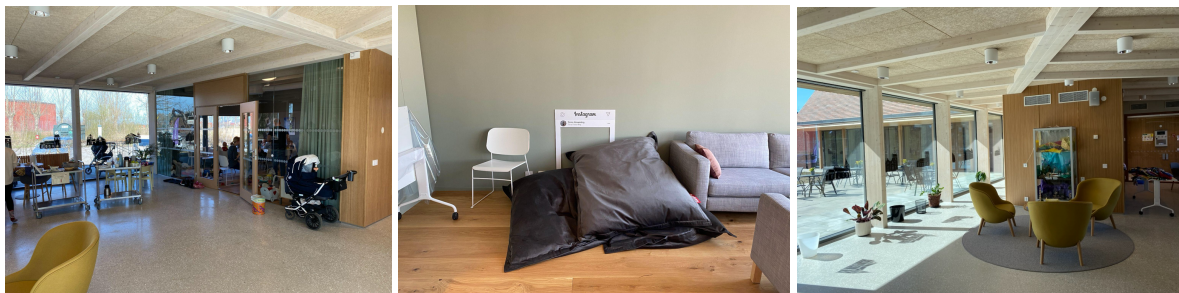
Interiors from the newly erected Stångby församlingsgård furnished for different user groups. Photo: Anna Wahlöö

The Church of Sweden has recently (2022) built a new “Församlingsgård” in Stångby. The facility is architecturally sleek and houses a meeting room that can be used for lectures, movie viewings, and religious services. There is also a room for activities with children and parents (such as a Baby Café), another large room for youth activities, with specific adapted furniture (kids size furniture for the small ones and sofas and duffle bags for the teenagers), office space for staff and a fully equipped kitchen. The församlingsgård is used regularly by the citizens of Stångby, but it means that they have little need for a church 4 kilometers away by bike.