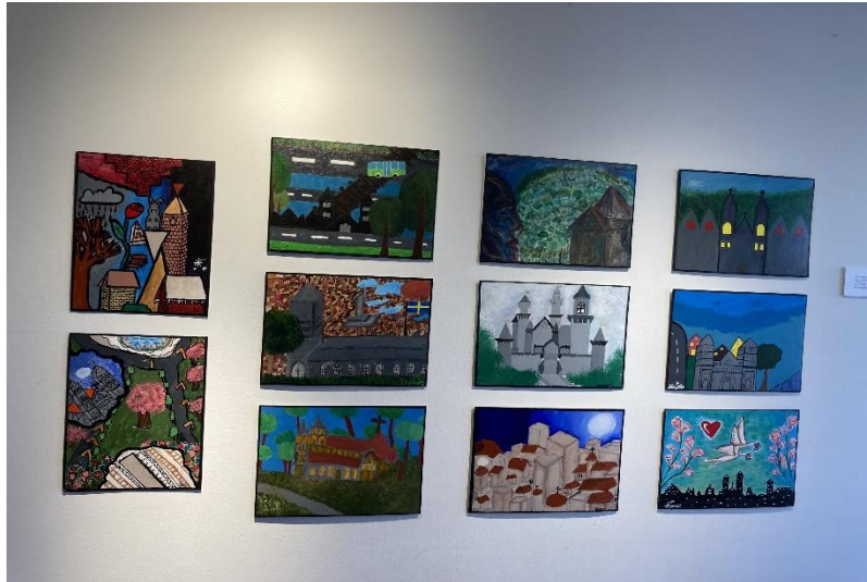
Figure 6 From the Public Exhibition, Lund

These trips and activities also provide spaces for the young people to share memories of other important places. Images of Afghanistan were shared through youtube videos of a bread ovens in rural villages. This prompted others in the group to share images and clips on their phones reflecting how flour was used in the cooking from their home countries. For one of the activities the young people were invited to create symbols that would communicate their memories of home to people in their new place. The list of the images that they chose to create were traditional coffee pots; a prayer mat; a man carrying goods up a mountain village path; symbols from different languages; a famous musician; flowers and trees. Two participants chose to draw a mosque twice in one piece explain that the mosque in their European city was the same as that in their home and so there was an element of continuity of their identity through feeling that their faith was valued and accepted which helped them feel a connection and a sense that they belonged.