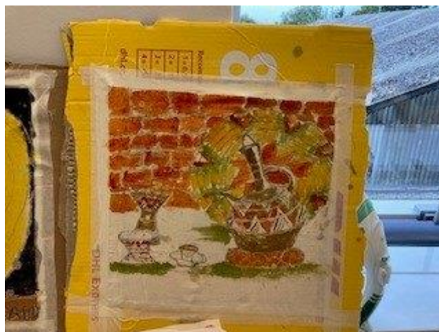
Figure 7 Eritrean coffee pot

But it also about holding onto past memories, as illustrated by one Nottingham participant who explained that his picture of 'the coffee pot is to memorise my country' .