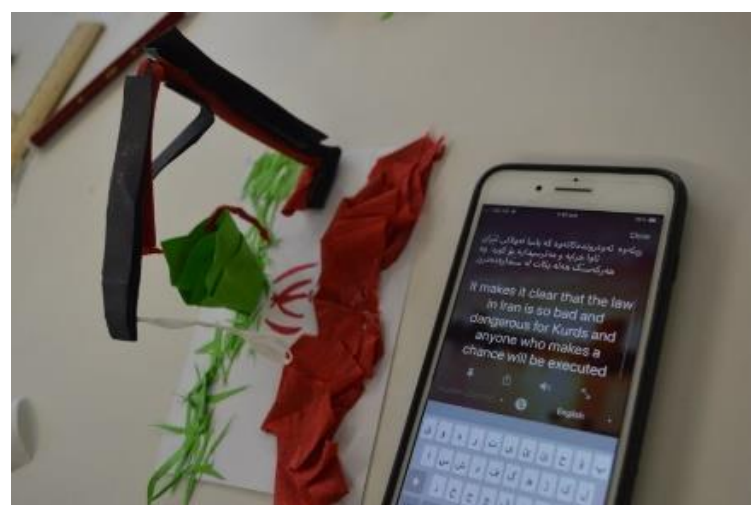
Figure 9 Explaining the piece

Our data also showed that developing a sense of belonging and attachment to place is made more difficult when there is a constant fear of being moved or removed because of our young people's fast approaching adulthood and related decisions about their legal status. This uncertainty challenges feelings of safety as is illustrated in Fikru's case study below which also demonstrates that belonging is not a static concept, as individual circumstances change, there is the need to continually navigate the processes of belonging.