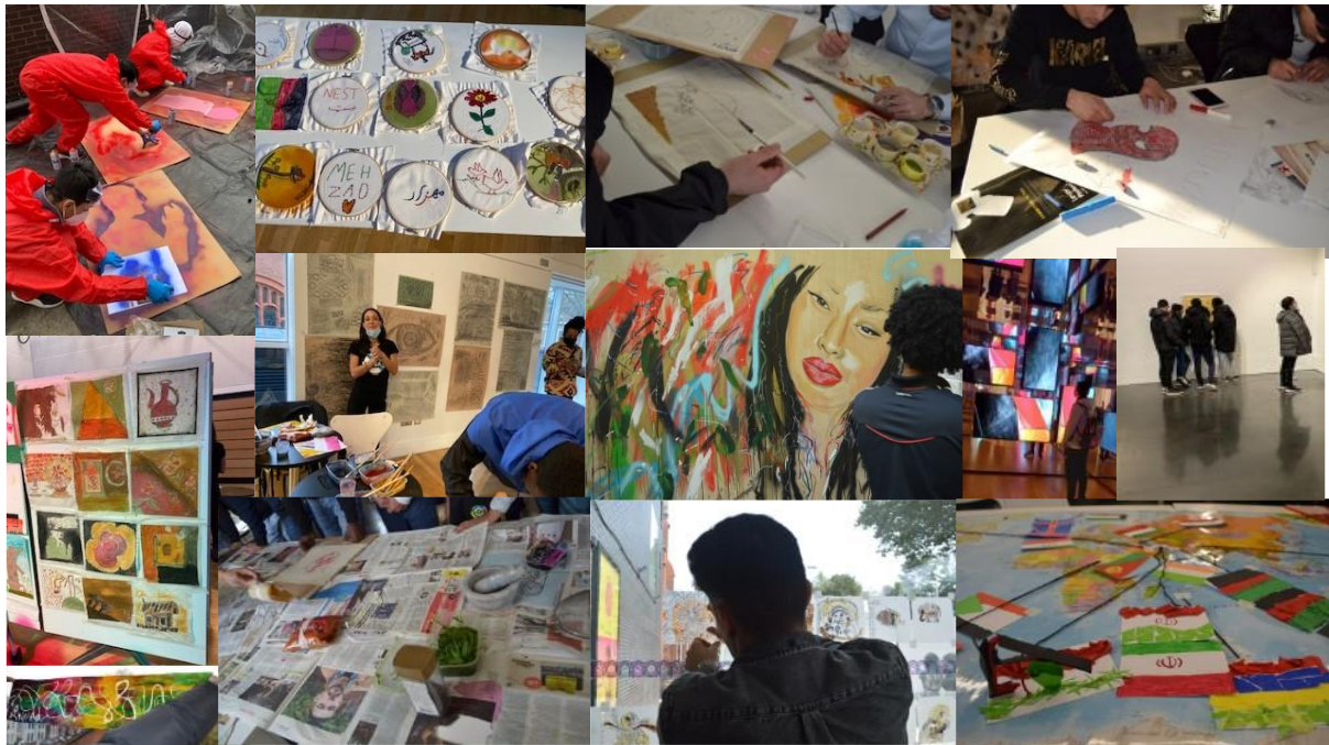
Figure 1 Examples of arts and cultural activities