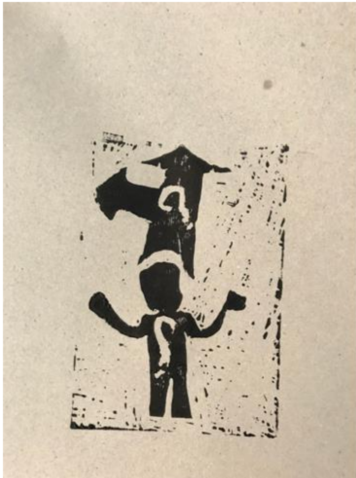
Figure 4 Linoleum print by Lund participant