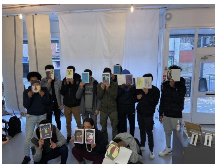
Figure 13 The young men's masks

In Nottingham, the project challenged stereotypical representations of refugees, particularly young unaccompanied males. The project showcased the skills and potential of the young new arrivals and the final exhibition offered opportunities for the public to see this potential summed up by a member of the public writing in the comments book: 'So pleased you are here. In our city. Your city. Thank you for your contribution to the exhibition.'