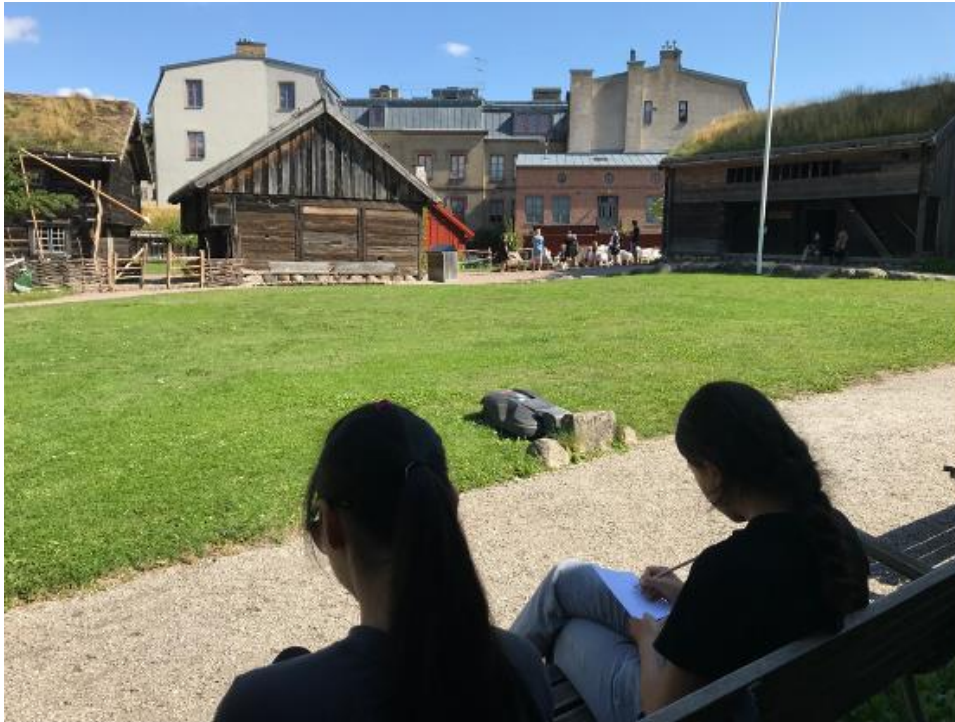
Figure 5 Participants sketching at Kulturen, Lund.

down on a bench outside, listening to birdsong and looking really carefully at a part of the museum, something was different: 'You can go and look at Kulturen, I did that before but I did not think that it was fun. But when I went this time, it was water and birds and I sketched and it feels really nice. I want to go there and sketch again' . From this example we learn that doing something in a place, not just looking at it, can make a great difference. Also, spending longer time at a certain place, concentrating on details, which you often do when you are sketching or painting, makes a difference when it comes to the perception of that place, 'I've begun to see things I've never seen before.'