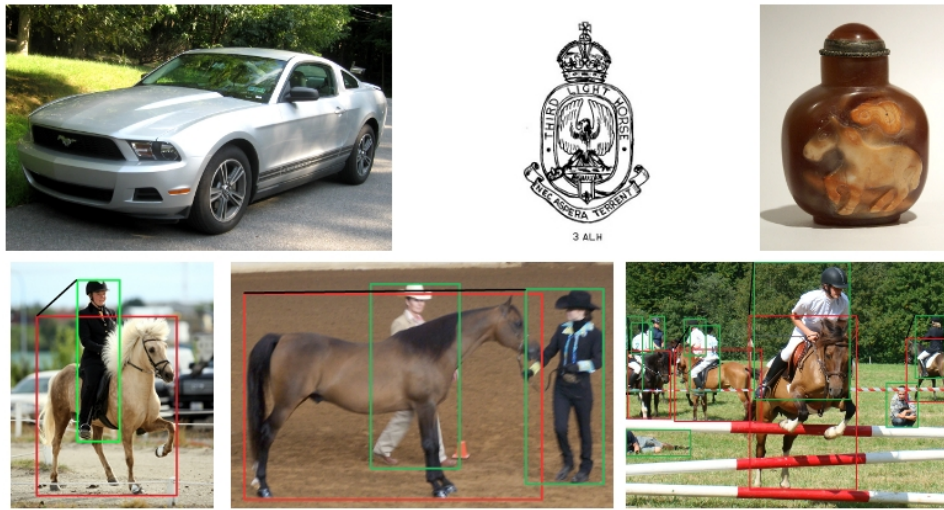
Figure 1: The upper row shows: A Ford Mustang, the 3rd Light Horse Regiment hat badge, and a snuff bottle. The lower row shows: A human riding a horse, one human leading the horse and one bystander, and seven riders and two bystanders. Bounding boxes are displayed.

solver (Stamborg et al., 2012) to parse the Wikipedia articles. For each word, the parser outputs its lemma and part of speech (POS). In addition, the parser produces a dependency graph with labeled edges for each sentence as well as the predicates it contains and their arguments. For each article, we also identify the words or phrases that refer to a same entity i.e. words or phrases that are coreferent.