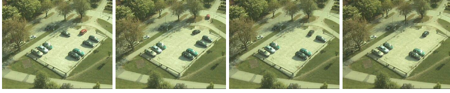
Figure 3: All events detected from the parking lot monitoring algorithm based on the proposed algorithm.