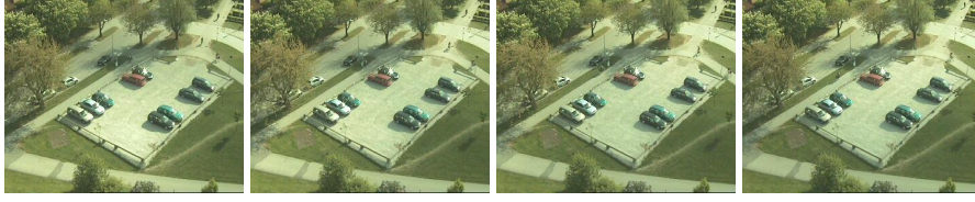
Figure 1: Four frames from the cloudy input sequence used to test the proposed algorithm.