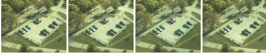
Figure 4: First four events detected from the parking lot monitoring algorithm based on [17].

one place in the parking lot to another. In both cases the proposed background/foreground segmentation algorithm generated the expected data, and the misstates were made by the simplistic event detection algorithm. Four detected events chosen from the entire sequence are shown in Figure 5.