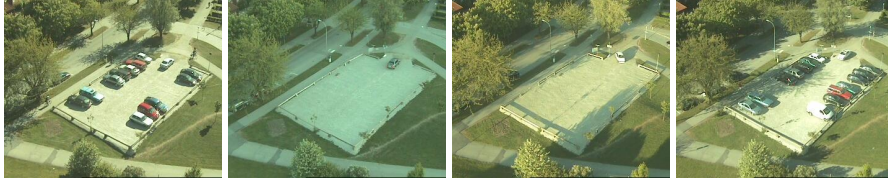
Figure 5: Four detected events chosen from the events detected by the parking lot monitoring algorithm based on the proposed algorithm when tested on a 16 hour sequence.

one place in the parking lot to another. In both cases the proposed background/foreground segmentation algorithm generated the expected data, and the misstates were made by the simplistic event detection algorithm. Four detected events chosen from the entire sequence are shown in Figure 5.