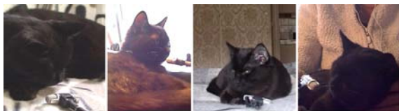
Figure 1. The microphone positions of all four cats during data collection.

Videos are available at http://purring.org