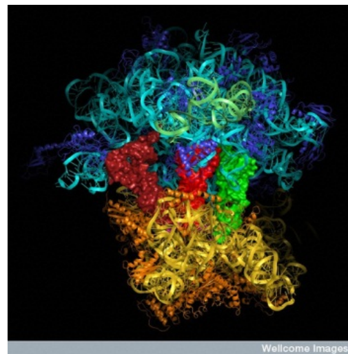
Illustration 1. http://nobelprize.org/mediaplayer/index.php?id=1207

In molecular protein biology after the crystallization process is successfully done the measured density between electrons are modeled into pictures in order to grasp the where the atoms are sitting in the molecule (Brändén & Tooze, 2009). (illustration 2)