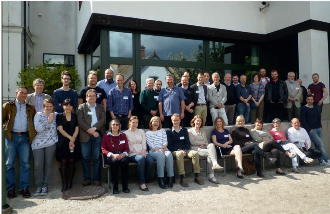
The members of the conference “What’s New in the Neolithic”, May 2013.