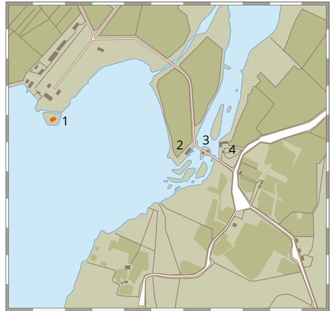
Fig. 5. Parts of a map from 1858–1861 showing the former main road passing Bergkvara while making a noticeable bend. 1 The tower house. 2 The mill at Örsled. 3 Smithy. 4 Mechanical industry. Drawing: Petter Lönegård.

The first is the bend the road makes in the pasture land, a bend that takes the traveller closer to the river valley (fig. 5). The bend is not caused by any topographical obstacle in the pasture land. The road could just as well have continued straight on (as the present road does). But by forcing the trav-