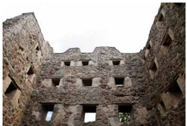
Fig. 4. The eastern gable of the stone house facing the lake had large windows. The same types of windows are present on the southern wall.

There is no doubt that the stone house was a very impressive building. As Anders Ödman has shown, it is interesting to note that many of the large stone houses that were built in the fifteenth century in Scandinavia actually were related