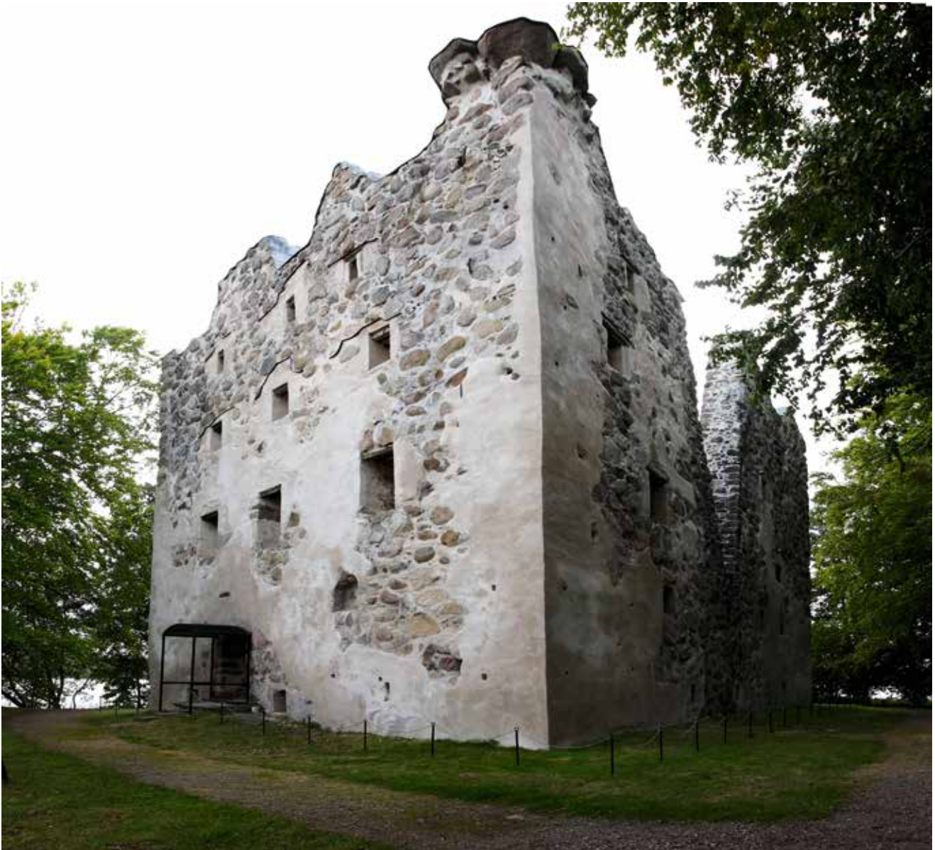
Fig. 3. The ruined tower house.

inside (fig. 4). Here we can see a completely different architecture, where comfort is put before military needs. It was not reckoned that an enemy would cross the lake. In this aspect Bergkvara is an interesting mix between older castles where military needs structure the architecture, and the younger Renaissance palaces where comfort and light are given priority over military needs. One can, for example, compare with Månstorp in Scania, built in the 1530s, where thick earth walls surrounded a stone house in Renaissance style with large windows (Ödman 2002:112ff.). The importance of the scenery looking out from inside the castle is an aspect that have recently been emphasized (Creighton 2009:168ff.).