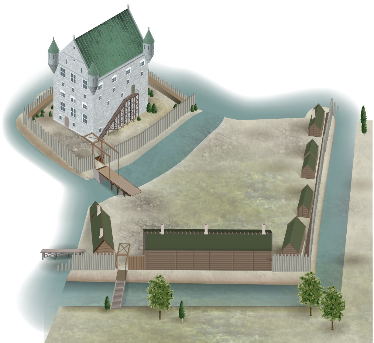
Fig. 8. A reconstruction of how the castle looked in the late fifteenth century. Drawing: Petter Lönegård.

bend, the glory of the lord of the castle became visible even to passers-by, and to travellers to Bergkvara this became even more obvious, when the garden and the fishponds fulfilled the aristocratic ambitions of the place. This type of signalling was probably meant to impress Arvid Trolle's fellow members of the high aristocracy (fig. 8). For the ordinary peasants in the area, many of whom had to pay their lease to the castle, the aristocratic landscape contributed to making social change impossible and embedded the social conditions and the status of the lord in the landscape.