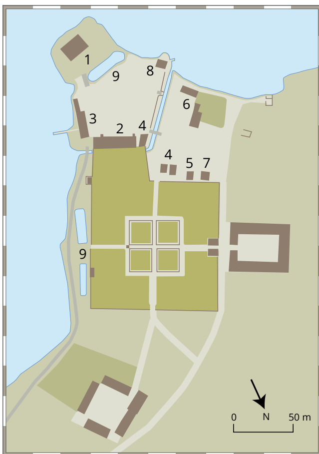
Fig. 7. Detailed map of the Bergkvara around 1700. 1 The tower house. 2 The manor. 3 Kitchen. 4-7 Storehouses. 8 Bathhouse. 9 Fishponds. Drawing: Petter Lönegård.

A large number of aristocratic elements can thus be found in the landscape around Bergkvara. The residence was a true castle. Defended by two moats and a bailey, and partly lying inaccessible in the landscape, the castle gave an impression of power and status. By forcing the main road to make the