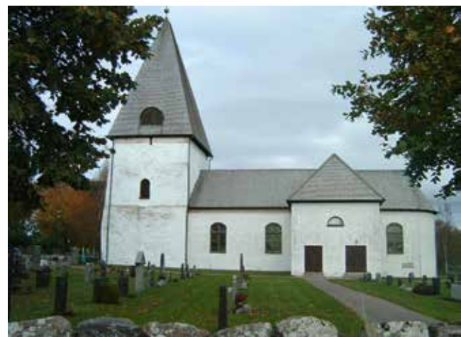
Fig. 6. Bergunda church with the large western tower. The oldest parts of the church probably date to the late twelfth or early thirteenth century.

The great western tower of the church was probably built in the late fifteenth century and most likely instigated and perhaps financed by the Trolle family (fig. 6). The tower is younger than the nave of the church, and a previously exist-