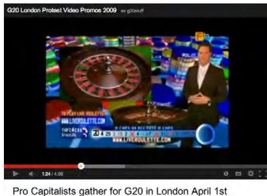
Figure 3. Framing the news anchor as croupier in the absurd theatre of casino capitalism.

Another example of the critical and playful remixing of content characteristic of the political mash-up video is seen in the Indymedia production 'Pro Capitalists gather for G20 in London April 1st'. In this video, scraps of CNN, BBC, RT and FOX news reports on the global financial crisis are 'jammed' so as to ridicule and subvert the statements of politicians, bankers and news anchors.