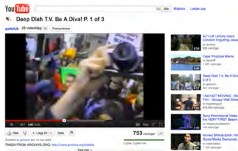
Figure 2. YouTube search result connecting struggles across time and space

as they demonstrate how YouTube provides a space in which new and old videos, raising similar political issues, are presented to the viewer in an intertextual web that may potentially connect past and present struggles.