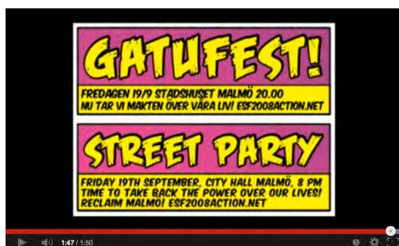
Figure 1. Pay-off in a mobilisation video for the ESF2008 (see appendix 1)

genre see appendix 1-4). Other labels used to describe this mode of video are 'protest trailers', 'demo-teasers', 'protest promos', 'call out videos', or 'riot porn'. Explicitly calling for political action, the mobilisation video urges viewers to take action by joining a protest in the streets, or to engage online by further spreading the call for action in personal networks. These are short, piecemeal, bite-sized slogans most often adapted to the time frame of a television advertisement. As a flexible genre, guiding rather than determining styles and strategies, mobilisation videos follow a set of shared dramaturgic rules. They bring together discursive resources and historical genres to stage injustice as a spectacle that requires action and set up a given space of action for the viewer. This is often done by drawing upon footage and photographs from previous demonstrations and actions that are re-appropriated and given new meaning in new calls for action. Mobilisation videos end with concrete directions for how to act upon what is witnessed on screen, usually by providing a link to a website where the viewer can get additional, more detailed information on the promoted event (see fig. 1).