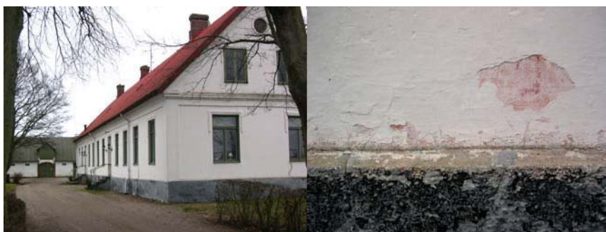
Fig 6. A typical example of vernacular southern Scandinavian architecture of the mid-19 th century. White limewash is the most frequent colour of farm houses today but yellow is slowly becoming more common. A closer look at the uncovered patches reveals the light red still used in the late 1960:s, as confirmed by the owner in a short interview ( L. Isie, Vemmenhög hundred, Scania county).

The southern rural part of Sweden is dominated by a 19 th century building tradition with many small farms and along the coast small fishing villages. Some of the farmers have had better economical conditions and have built bigger houses of better materials. Despite this the colour schemes of farm houses and fishermen's villages have much in common today. The houses are, in most cases, limewashed white with either green or brown windows. Investigated buildings of both types show that this was not always the case. The original lime wash colour scheme of the farmhouses was light colours: light blue, light red, light green and even reddish purple (Fig. 6). These colours are practically forgotten today, or at least not visible anywhere. Today farm houses in this area are lime washed white, or have red brick façades. The fishermen's houses on the other hand were in all cases, but one, originally white lime washed. The exception was a fisherman's house inhabited by an artist who washed his house red in the early 20 th century. Windows and doors are often green today and this seems to have been a common colour also in the mid 19 th century. The pigment used from the