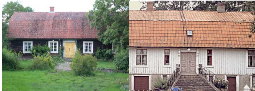
Fig. 9 From the middle of the 19 th century the light coloured and balanced Swedish 18 th century mansion house was the inspirational source for this type of architecture. It is in many ways similar to the houses of the previous area, Listers hundred in Blekinge, but the colour schemes course of events are different. To the right an example of the colour scheme before the panelling, with dark tared wooden construction and polychrome painted doorway. To the left the colour schemes after the panelling with light grey panel, white details and brown windows and door (Gillsätra and Spjutterum, Runsten hundred, Öland county).

Houses were panelled partly for aesthetic reasons, partly for practical. The panel stopped the draught. During the early 20 th century when many of these façades were in fact panelled, the colour schemes were dominated by light colours in linseed oil paint with green, red, white, brown or even blue windows (Fig. 9).