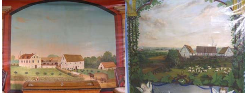
Fig 4. Wall-papers illustrating the farm when it was newly erected, an irreplaceable piece of evidence, dated and with clear information about the original exterior colour scheme (Hemmingsmåla and N. Röhult, Lister hundred, Blekinge county).

used so as to be able to see the colours in situ, and not least in daylight, whereas to be sure of unveiling all the paint layers, microscope analyses are added (Hædersdal, 1999).