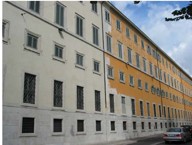
Fig. 5 The Palazzo Quirinale, Rome is a case where an investigation of the colour scheme has led to the implementation of new colours. The terracotta coloured façade, to the right, universally accepted until late 20 th century, was changed into the 18 th century light colour scheme after analyses first made by the Danish architect Bente Lange.