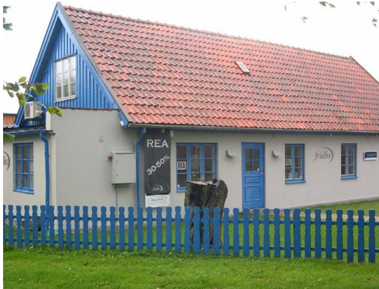
Fig.1 The overwhelming amount of information as to colours cause a disorder of colour schemes of the facade. Leaving the details without the necessary accuracy, as in this example of a house from the 19 th century, where drain pipes, fence, gable and door have the same bright blue colour.

Sweden both for cities and for some rural areas. The colours are general though, and there is no instruction as to how to combine them to create a locally befitting colour scheme, typical of a certain area. Certain buildings, chosen by the regional board, are protected (byggnadsminne) by laws (Lagen om Kulturminnen m.m.1988:950 and Kulturminneslagen). These buildings are studied more closely and depending on the reason for the special protection program an investigation of the colours and the colour scheme is sometimes carried out. City planners, antiquarians and conservators, when asked how to increase the public consciousness of colour schemes in local communities (e. g. in a fishing village), declared that they prefer information to legislation. But in some recent cases in Sweden, it is evident that lack of money to pay for colour scheme investigations leave city planners with one remaining solution: legislation without relevant scientific investigations.