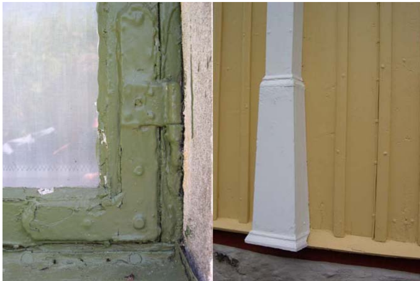
Fig 2. The analyses of details such as these are necessary to decide the age of the façade material, the only possibility to establish a reliable date. The façade could not have been scraped clean since it seems to be quite clear that the idea of scraping a whole façade or even a couple of windows is a modern custom, from after the 1970:s.

The presuppositions of the project were several: vernacular architecture is a neglected field of research; the character of the evidence is suitable in the sense that rural houses in