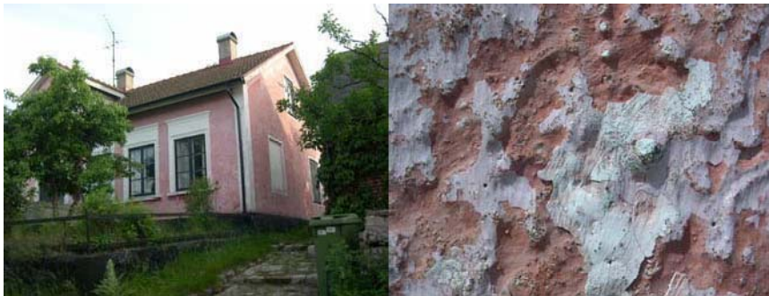
Fig 7. The building to the left is a typical fisherman's house or rather a captain's house. During the second half of the 19 th century the fishing villages along the east coast were inhabited by captains who probably brought new ideas and new colour schemes as well as new designs for the façade. Compared with other fishing villages along the south coast light and bright colours of plaster instead of white is a notable distinction, as are more articulated details of the façades, e. g. windows. To the right a close-up of the light red colours. Which in this case, indicates, the possibility to through an ocular investigation find out of the past colour schemes in situ (Baskemölla 5:19, Albo hundred, Skåne county).

As compared to the south coast, where houses were homogeneous in their colour schemes, the fishermen's houses along the east coast were very miscellaneous (Fig. 7). This is true for original colour schemes, for the colour