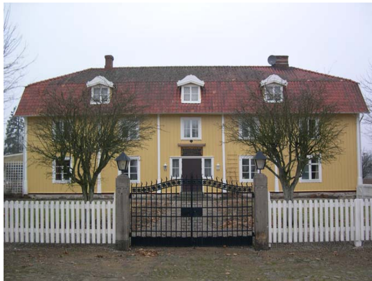
Fig 8. The yellow colour of the panel, with the white details and windows, is the most common colour scheme of this area today. This house, erected in 1834, was originally neither panelled nor yellow though. It had visible timber joints and was covered with red emulsion paint. When panelled, it was painted with light yellow linseed oil, gradually brighter yellow as time went by (Stora Rösjö, Lister hundred, Blekinge County).

In this area, further north, wood was the dominating building material. The farm houses in the inland were panelled and linseed oil painted during the 19 th century, and they still are. Today the most frequent colour scheme is a yellow façade with white details and windows and brown doors (Fig. 8). The investigation revealed light colours, as in the other areas, especially a light red colour and somewhat less frequent, light grey, light green and light blue. The light red colour seems to come from a locally produced earth pigment and has been mixed with white and used as a linseed oil paint. Soil in Sweden can seldom be used as earth pigment. It is possible to find descriptions of exploitable