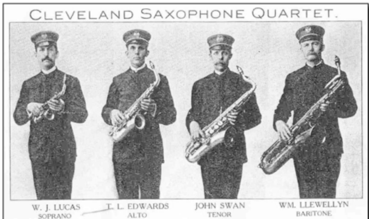
The Cleveland Saxophone Quartet.