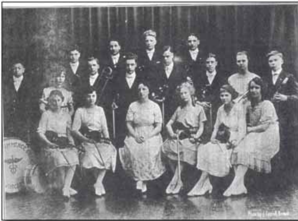
THE HIGH SCHOOL OF COMMERCE ORCHESTRA

There is a picture and some information on this high school orchestra in the 1921 yearbook. 27 The list of musicians does not entirely correspond with the photograph.