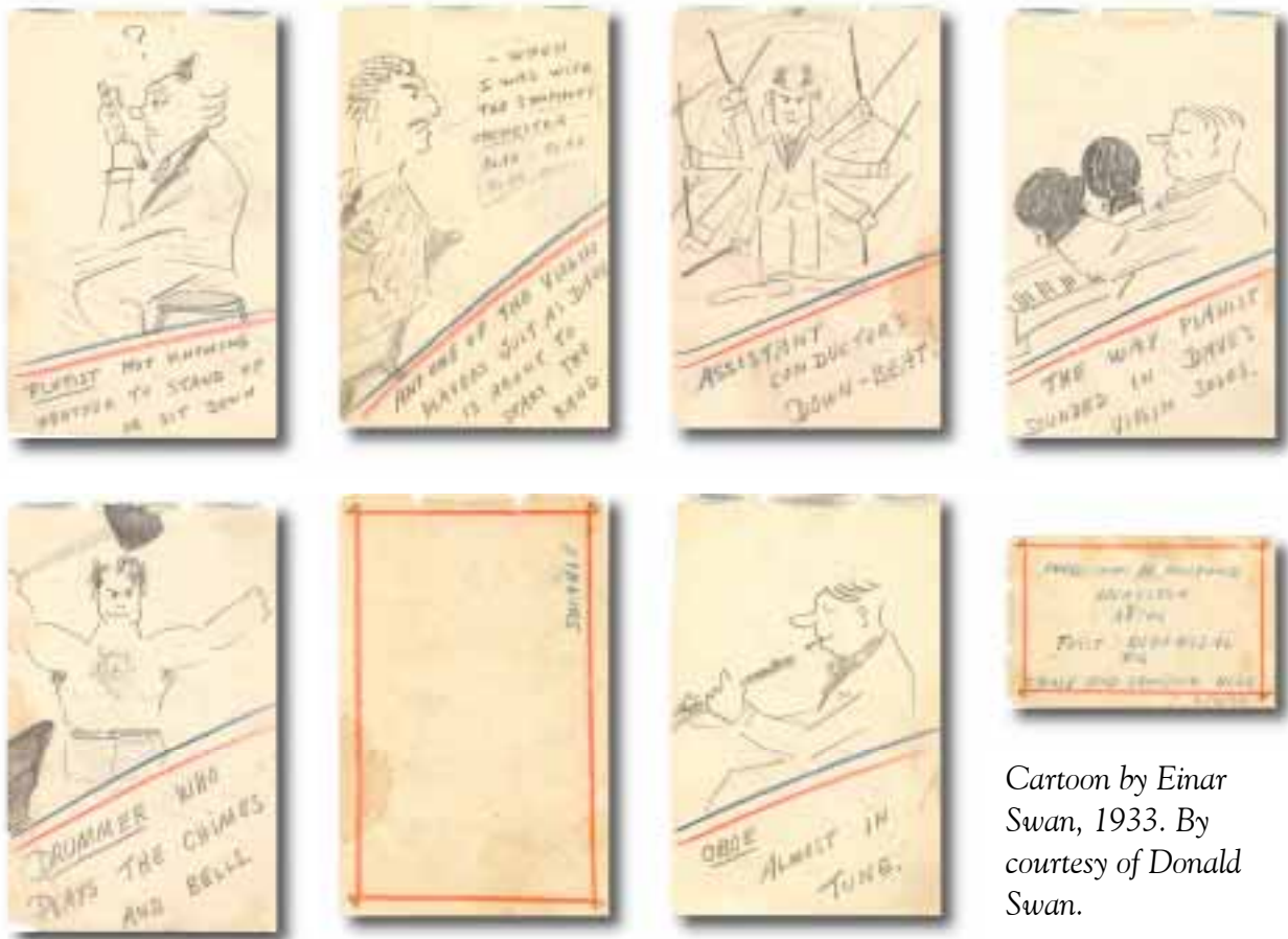
Cartoon by Einar Swan, 1933.