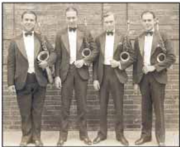
Lopez musicians: "The one hundred thousand dollar saxophone section" is written on the back of this photo, probably taken in 1926.