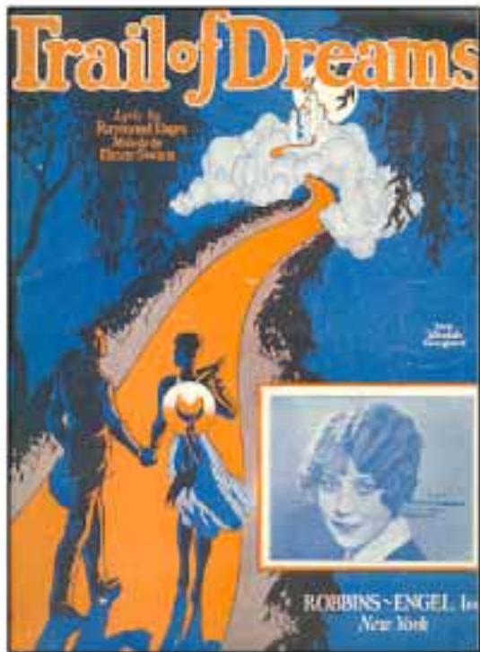
"Trail Of Dreams" sheet music.

"The Tip Off Cues", "Swan's Serenade" (possibly a theme song for Swanie's Serenaders?), "The Spirit of St. Louis", "Closet Strut", and "Orient" are also mysteries.