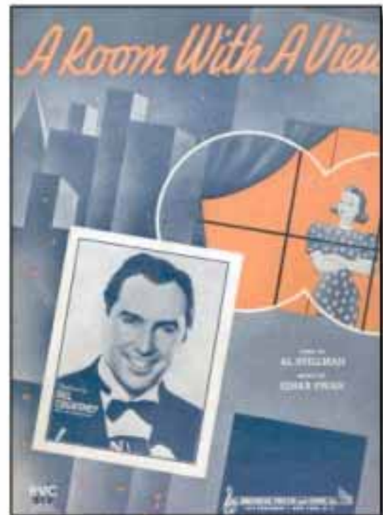
"A Room With A View" sheet music.