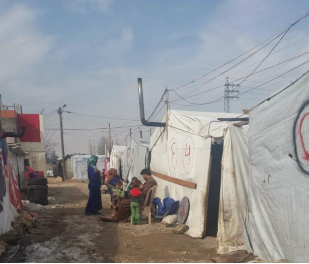
Figure (2) Spaces where men gather to socialize and to have coffee or tea.

-Semi public or private spaces that is threshold between the private realm of the tent and the public realm of the areas around it. This in-between space is where refugee has the capacity to control the amount of interaction. This threshold is just an edge which is the membrane of the tent itself. In some cases especially in Tolyane camp in Lebanon, some of the tents have expanded this space using elements such as curbs or planters or even light structures from wood and cardboard sheets.