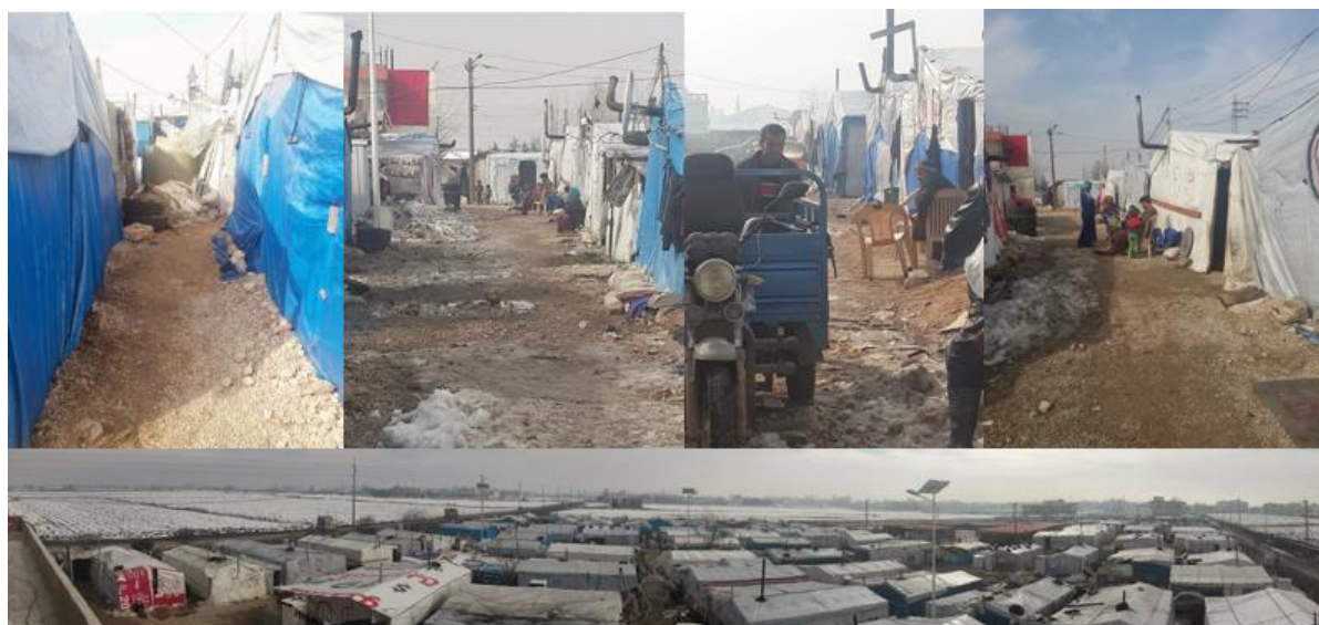
Fig 1: Collage images for Tolyane refugee camp in Lebanon one of the case studies.