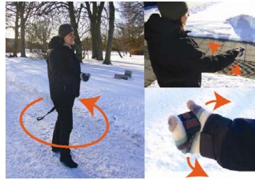
Figure 6. a) Whole body rotation keeping the arm and hand fixed relative to the body, b) arm scan, c) wrist flex

We saw three main types of standing still gestures. The first, which basically all users made use of, was to hold the device out in front of the body, keeping the arm and hand position fixed relative to the body, and walk around on the spot (sometimes in a small circle), see figure 6a. A gesture which was used both while walking and while standing still was the arm scan. In this gesture the arm was moved to the side and back again, see figure 6b. This gesture occurred to one side only or from side to side. The third type was hand movement only – the user moved the hand by flexing the wrist (figure 6c). This gesture was also used both standing still and while walking.