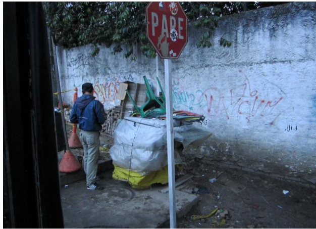
Image 2: Photo of a vendor outside the transitional zone in the district of Suba.

In contrast with the ‘non-formalized’ vendors, the group in the ‘transitional zone’ enjoy the possibility to have a permanent structure to work. The city gave vendors a basic tent and vendors have the possibility to renovate and improve this infrastructure. For that reason, the vending zones look different from one place to another. For instance in the district of Chapinero the zone was administered by a group of handcrafters that decided to use their own creativity and resources to improve the tents, as it can be observed in the following picture (Image 3).