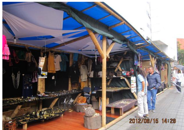
Image 3: Photo made by the author in the transitional zone of the district of Chapinero. Bogotá, Colombia. 2012.

In contrast with the ‘non-formalized’ vendors, the group in the ‘transitional zone’ enjoy the possibility to have a permanent structure to work. The city gave vendors a basic tent and vendors have the possibility to renovate and improve this infrastructure. For that reason, the vending zones look different from one place to another. For instance in the district of Chapinero the zone was administered by a group of handcrafters that decided to use their own creativity and resources to improve the tents, as it can be observed in the following picture (Image 3).