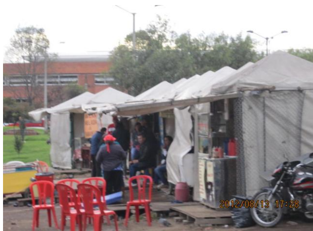
Image 4: Photo made by the author in the transitional zone in the district of Tunjuelito. Bogotá, Colombia. 2012.

In most places, vendors used the tents given by the government (see Image 4) and added some additional furniture like chairs and tables for their customers.