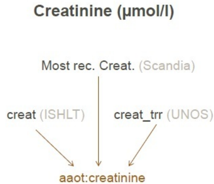
Fig. 1. An unification of the variable representing the most recent creatinine level of the recipient.