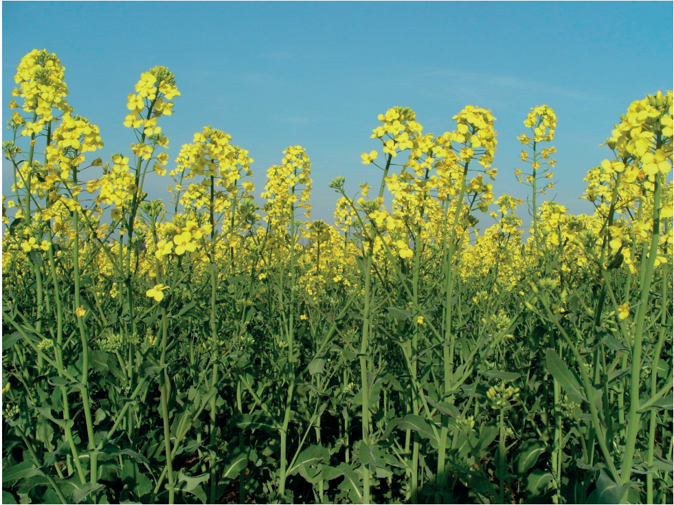
Figure 1: Flowering oilseed rape at Lönnstorp in May 2011.

pathogens and the depletion of nutrients, winter oilseed rape is not grown in the same field every year, but in rotation with cereals; in this part of Sweden, it is traditionally grown in the sequence barley - winter oilseed rape - winter wheat - sugar beet, but there exist also other sequences (Wikström 1997).