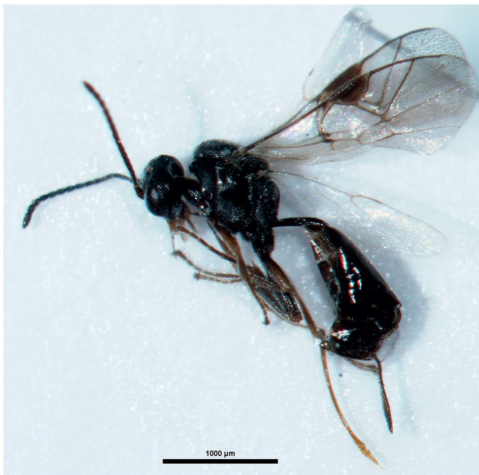
Figure 3: Tersilochus heterocerus (Ichneumonidae: Tersilochinae), one of the key parasitoids of the pollen beetle.

Oilseed rape fields are complex habitats that harbour many other insect species ( papers III and IV ). Paper III focuses on the species composition of those parasitoid and host species that were found in each site and can be linked to each other and to the oilseed rape habitat based on published host records. (For time reasons, I constrained the analysis to herbivorous Coleoptera and Heteroptera, and their respective parasitoids.) In addition to species composition, paper III also analyses the interaction networks which result from this potential linkage.