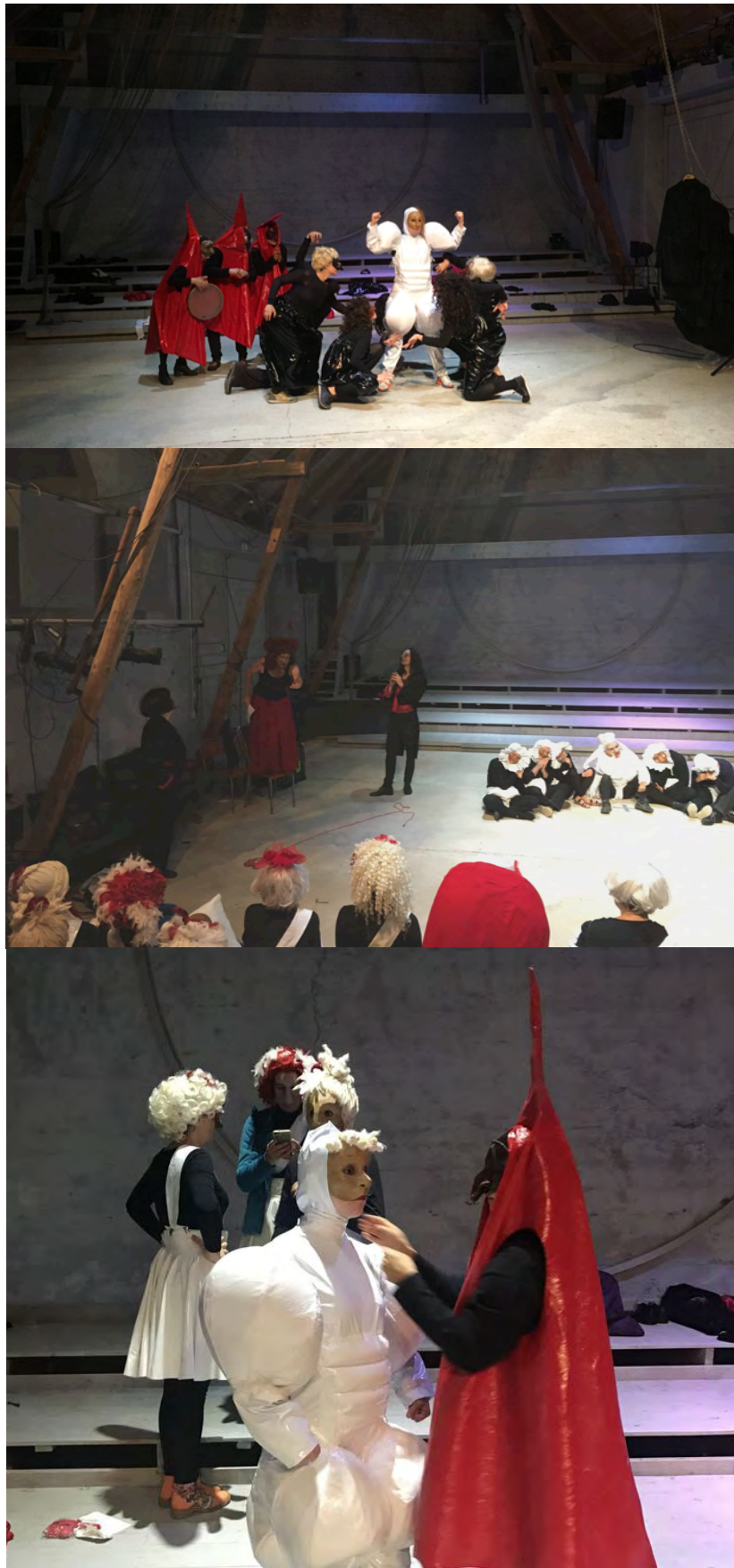
Late night rehearsals in the big theater