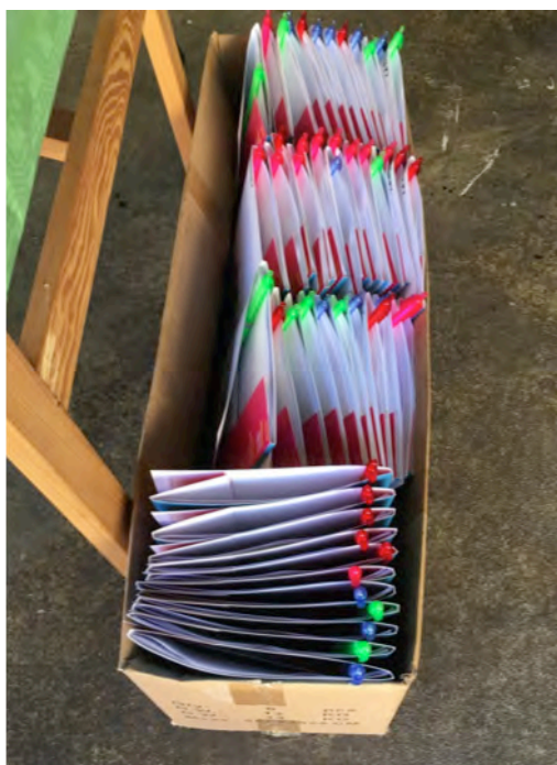
The Manifesto and all the informations for the TMR Festival