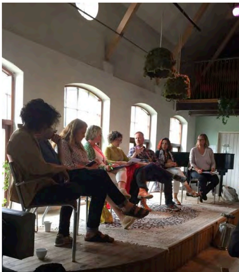
Panel from 2 nd day: Seminar II