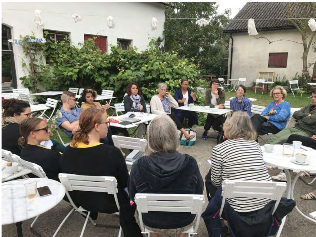
Seminar II - Group 3: Artistic tables

One recurring conclusion was that there is a need for everyone in power (whether temporary or for a longer term) to be aware of one’s own responsibility. Whether we are of a certain gender, ethnicity, religion, ability or socioculturally privileged part of the world we will always have moments with access to more or less power. There is a need for love, conscience and compassion with the Other, and an awareness of power as a result of continuous inner and outer dialogue and negotiation.