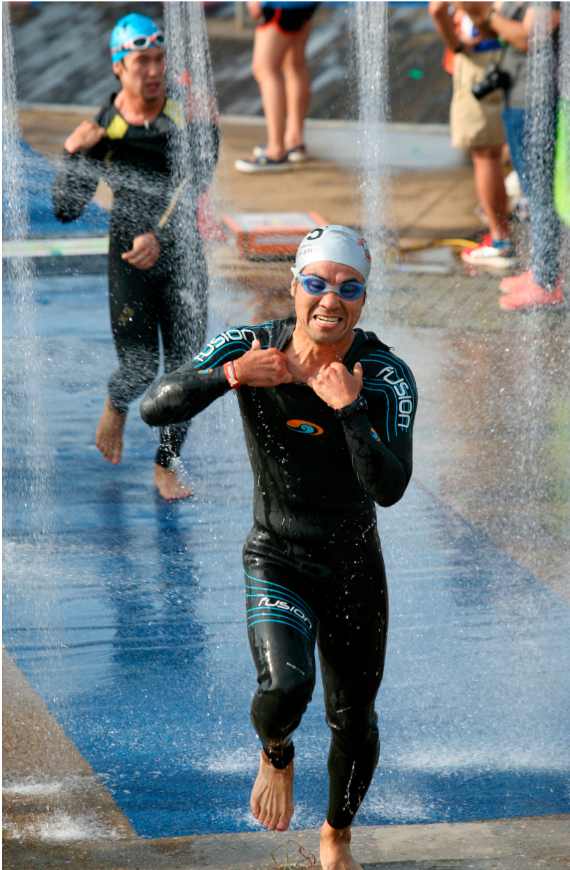
Triathlons combine swimming and cycling with running extreme distances