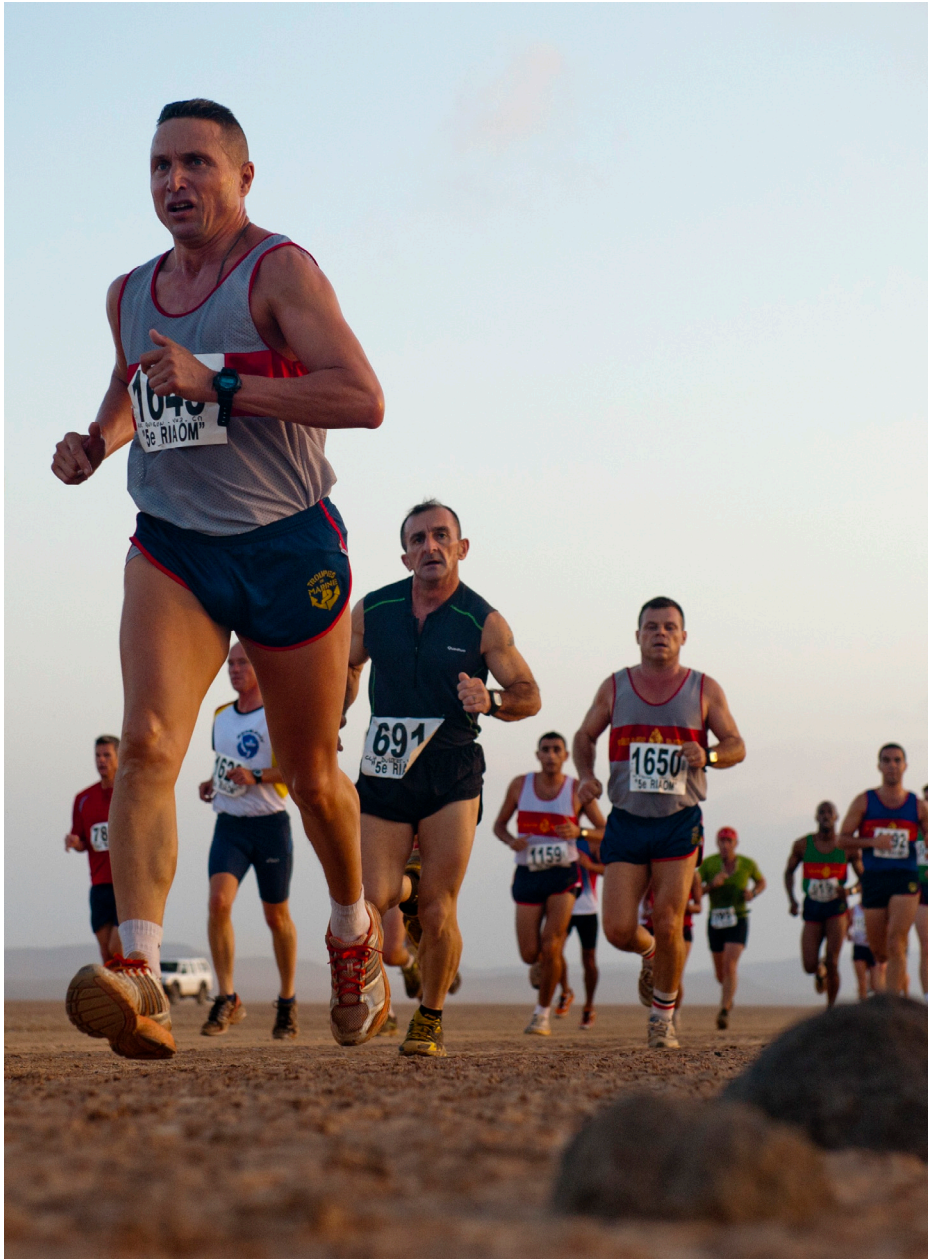
Ultra-distance races may be up to 1600 kilometres in length and often take place in inhospitable locations, such as the Alps, the Sahara desert or the Arctic.