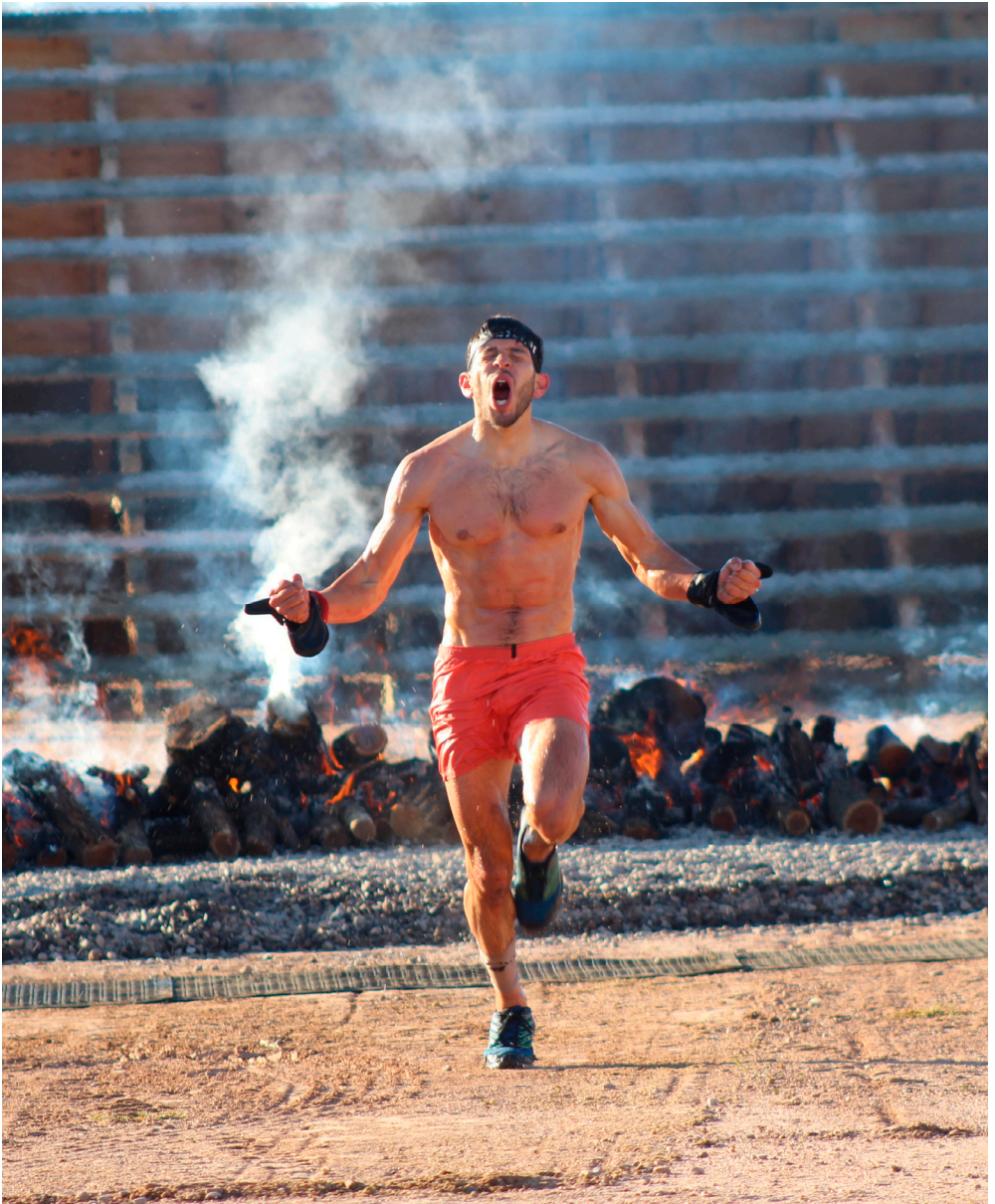
OCR participants endure torturous obstacles that involve plunging into icy water, dragging themselves through waist-deep mud, or crawling through burning tyres.