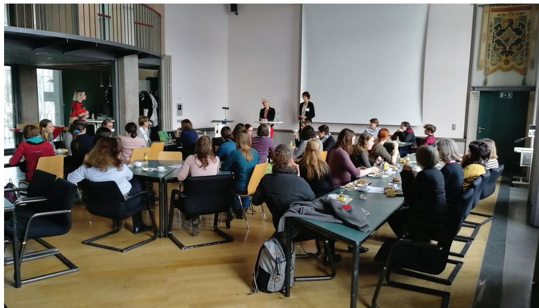
Figure 2. Meet and greet event at the 2019 DGG meeting in Braunschweig, Germany.

Our most popular event is the “Meet & Greet” breakfast at the annual DGG conference. The breakfast was initiated by female DGG members in 2014 and has quickly evolved into an established event at the annual meeting with continued high demand. Female DGG participants can sign up with their conference registration. The breakfast is organized locally by volunteers, and in the past years we have invited external guest speakers for an impulse talk