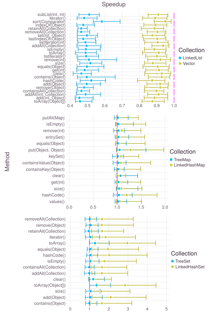
Figure 2: Median speedup of various collections compared to baseline (in magenta), with 25% and 75% quantiles

JBrainy does not explore iteration over lists directly. However, the implementation of the operations toArray() and hashCode() is dominated by iterating over the underlying collection, so we use these as