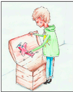
Child watches alone