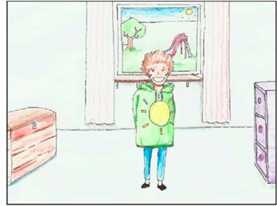
Experimenter asks – shared context