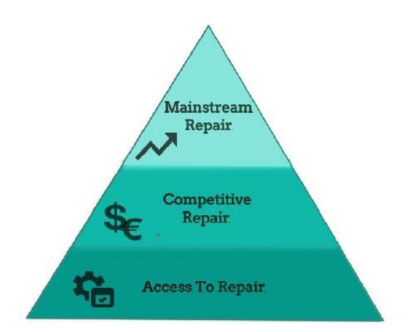
Figure 1. Barriers for repair, categorized into three levels (Svensson et al., 2018)

Barriers in access to repair can be exemplified by waste legislation restricting repairs. Reparability of products is an issue that is only partially addressed by the EU (Deloitte, 2016). According to the EU Waste Framework Directive (2008/98/EC), products that are discarded are subsequently defined as waste and subject to legal measures regarding waste management. According to article 6 (1) waste ceases to be waste after having undergone recovery processes (Directive 2008/98/EC). Therefore, it can be assumed that discarded products cannot be reattained into a circular system without being subject to recovery processes, such as recycling. In addition, chemical legislation has been updated with the purpose to phase out harmful chemicals in new products. This results in difficulties with reusing and recycling older products containing these chemicals (Dalhammar & Milios, 2016). In fact, if second-hand stores choose to sell products that contain chemicals that are currently regulated, they must pay an allocated tax in order to sell them (Nilsson et al., 2017). This impairs the willingness to handle such second-hand products.