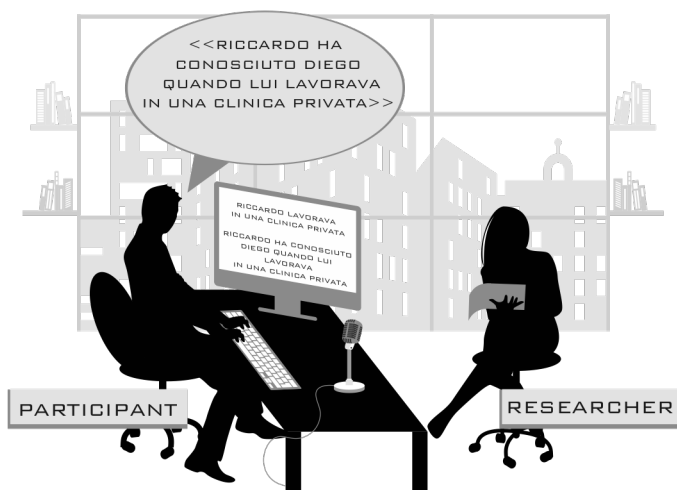
Figure 2. Experimental procedure for the speech production task (Studies II and III).