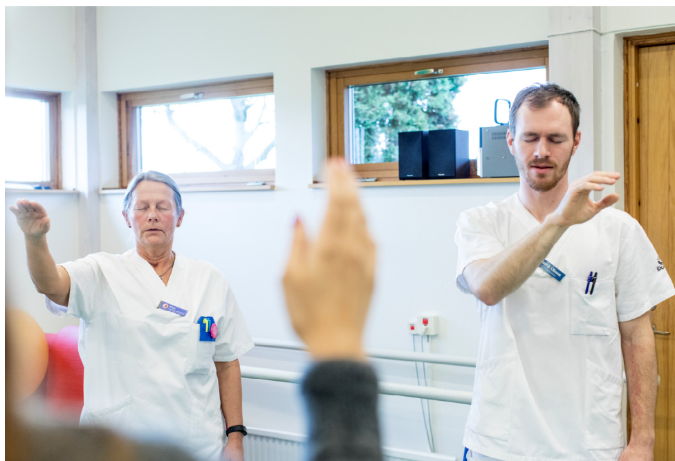
Picture II. Employees at one of the participating ICs engaging in a deep breathing exercise.

Throughout the intervention phase, all employees at the participating centres had the opportunity to influence and evaluate the recovery activities, by communicating with members of the inspiration group or leaving a note in an anonymous suggesting box. In addition, the whole employee group was given time to reflect on the project at workplace meetings, making joint decisions on how to move forward. This was a recurring event for the participating centres; scheduled once a month during the year of the intervention.