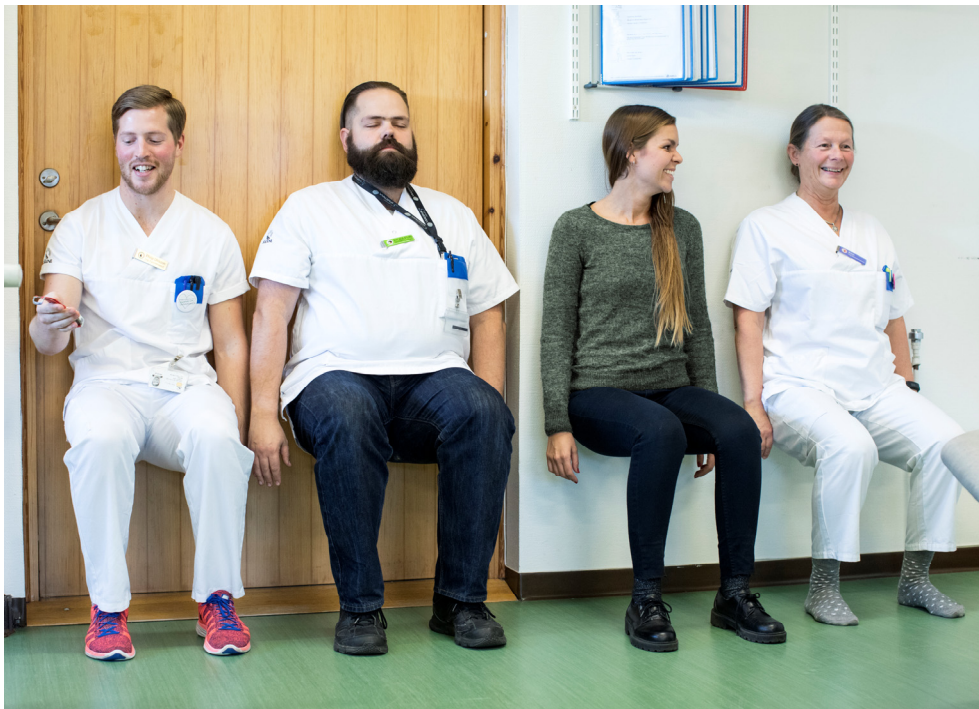
Picture I. A joint physical activity exercise being performed at one of the participating ICs.

employees present, were useful for this kind of events. Another example of an activity to promote companionship was the joint lunch break walks. The participants decided on a time and place each week, and anyone who had the opportunity and desire to participate could do so. Besides fresh air and physical movement, the joint walks gave the employees an opportunity to talk, both by reflecting on work events and by sharing moments of non-work-related social chats. Even though the organized after-work activities originally were not included in the set of recovery activities during the workday, they became a part of the intervention. This emerged from the employees' desire to socialize and get to know each other outside of work, with hopes of a ripple effect on the workday.